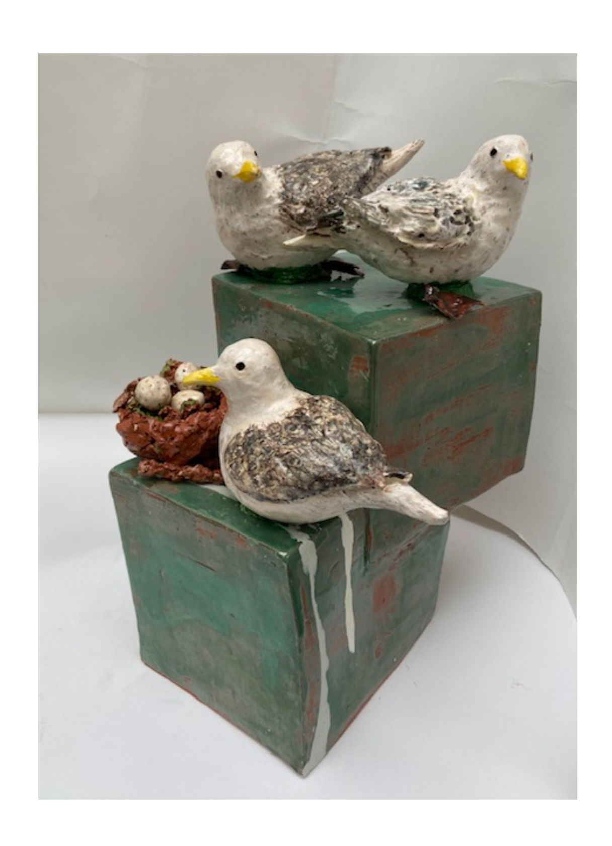
12. Kittiwakes 53cm x 33cm x 33cm £545