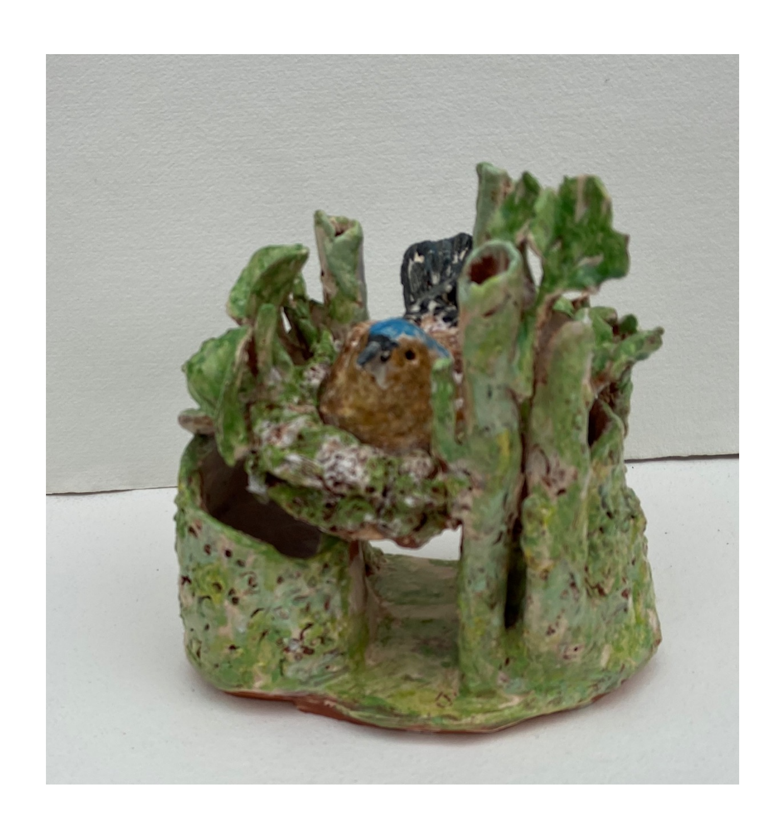
6. Small Chaffinch on Nest 20cm x 20cm x 16cm £260