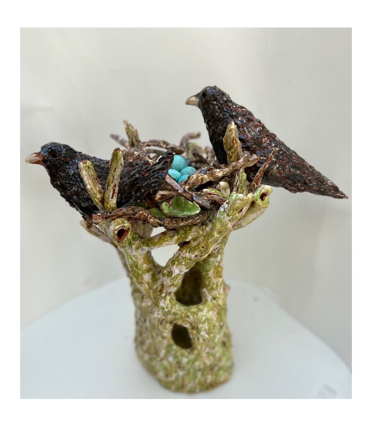
11. Crows 43cm x 33cm x 33cm £400