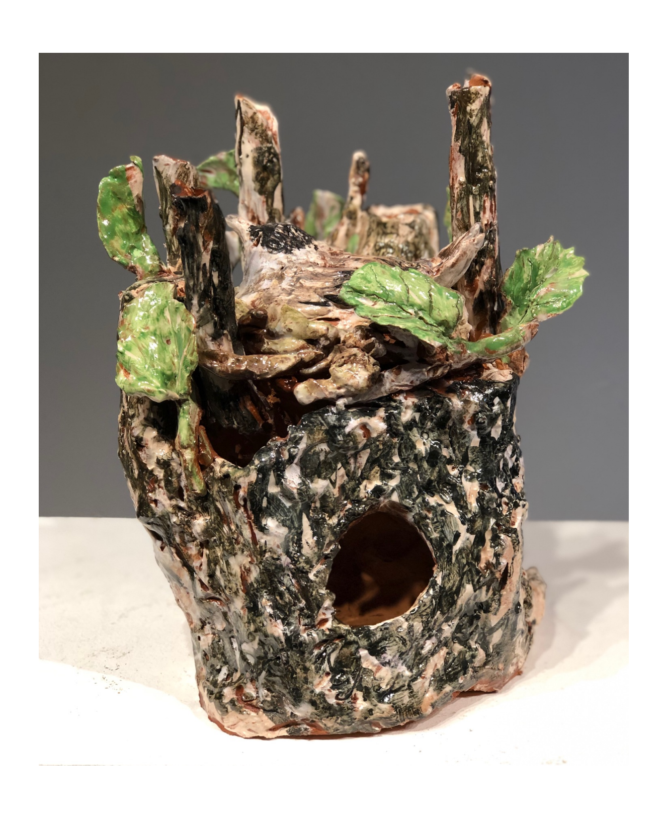
3. SOLD Small Nesting Black-cap 22cm x 18cm x 18cm £285