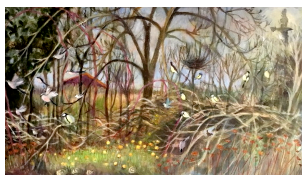
A Hedge in Winter, 2020. Oil on board. H710mm W410mm. (Cat No 18.)

I hung my first bird feeders outside the horsebox one January afternoon.