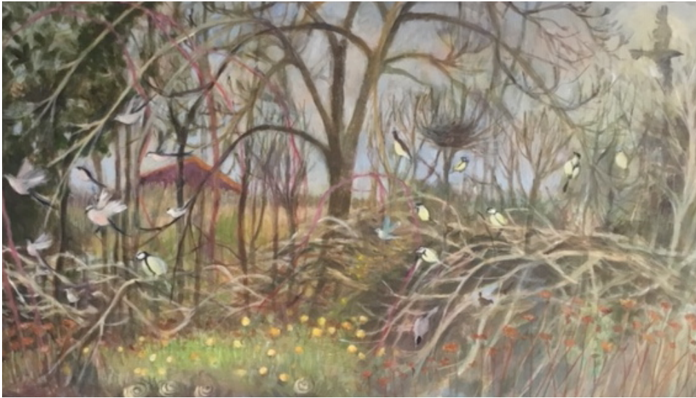
18. A Hedge in Winter, 2020. Oil on board. H710mm W410mm £1,200