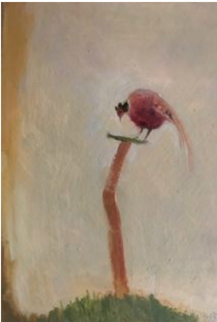
12. Birdfeeder , 2020. Oil on board. H185mm W130mm £400