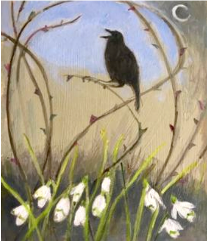
3. SOLD 6pm , 2020. Oil on board. H165mm W140mm £400