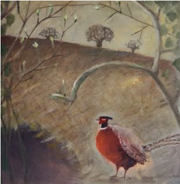
19. SOLD Low Sun, 2020 Oil on board. H200mm W200mm £450