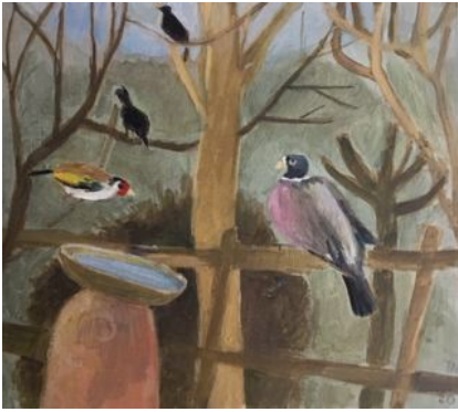
1. Bird Friendly , 2020. Oil on board. H135mm W155mm £400