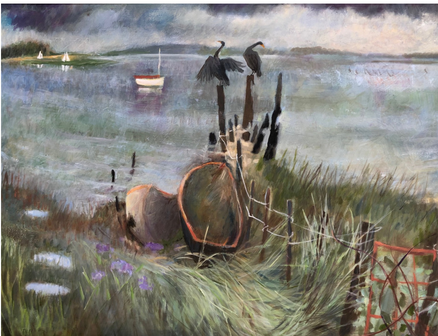
24. SOLD Drying their Wings, 2019. Oil on board. H450mm W560mm £1,800