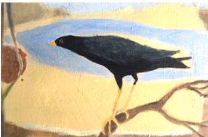
4. Stab , 2020. Oil on board. H100mm W170mm £400