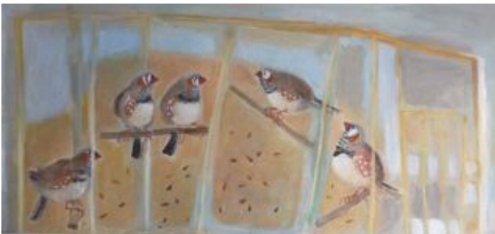
16. Ipswich, 2020. Oil on board. H215mm W460mm £800