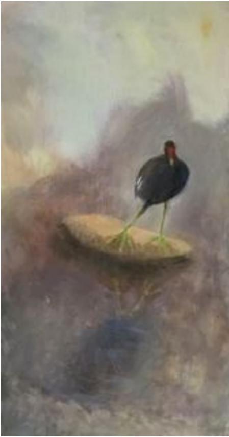
15. On a Floating Thing, 2020. Oil on board. H295mm W155mm £600