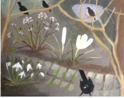
6. Dusk , 2020. Oil on board. H140mm W180mm £400