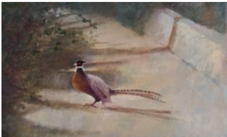
23. SOLD In the Absence of Cars, 2020. Oil on board. H140mm W230mm £400