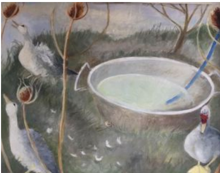
8. Two Females . Oil on board. H310mm W380mm £750