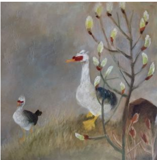
20. Pussy Willow, 2020 Oil on board. H200mm W200mm £500