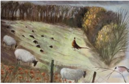
14. Exotic, 2020. Oil on card. H210mm W335mm £600