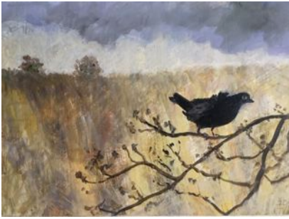
2. Wind , 2020. Oil on board. H135mm W180mm £375