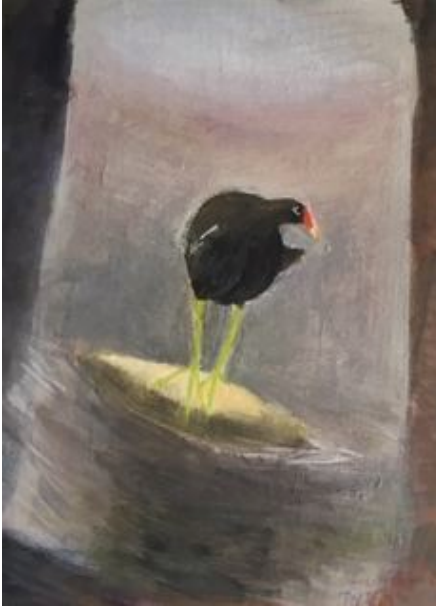
7. Moorhen , 2020. Oil on board. H205mm W150mm £600