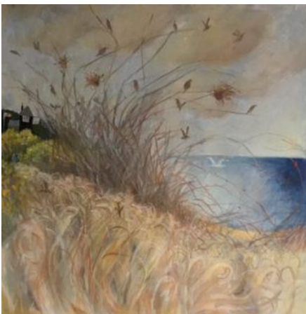
13. SOLD Let there be Birds , 2020. Oil on canvas. H500mm W500mm £900