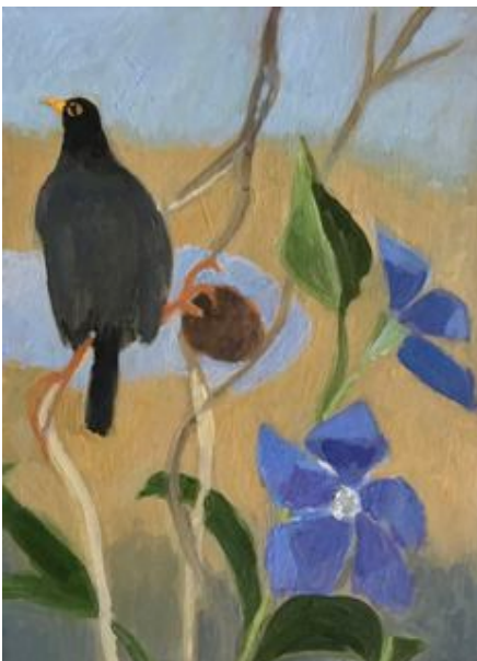
9. Look before you Eat , 2020. Oil on board. H135mm W100mm £375