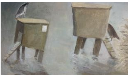
11. Houses , 2020. Oil on board. H255mm W180mm £480