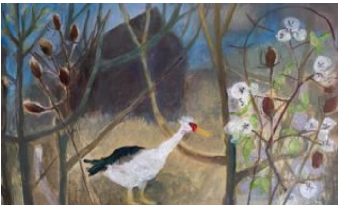
17. Spring is in the Air, 2020. Oil on board. H140mm W235mm £450