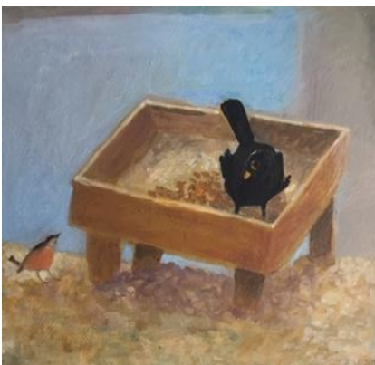
5. She Made Him a Ground Feeder , 2020. Oil on board. H130mm W140mm £300