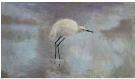
22. Under a Cloud, 2020. Oil on board. H100mm W175mm £300