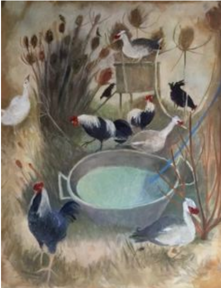
10. Living in Harmony , 2020. Oil on board. H480mm W380mm £1,250