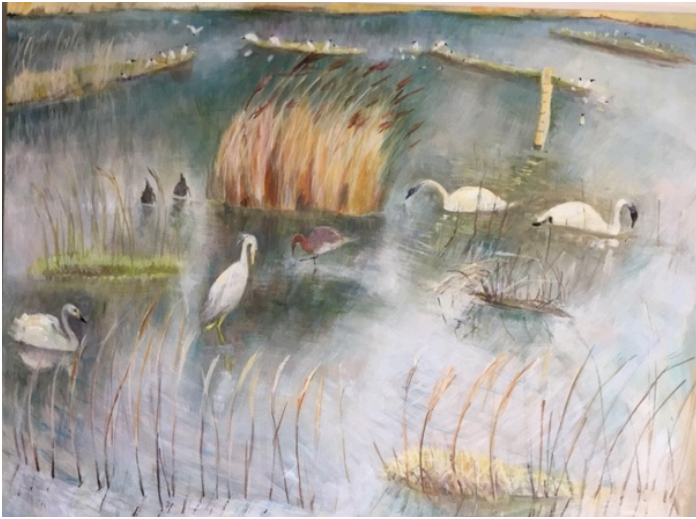
21. Minsmere, 2020. Oil on board. H450mm W610mm £1,550