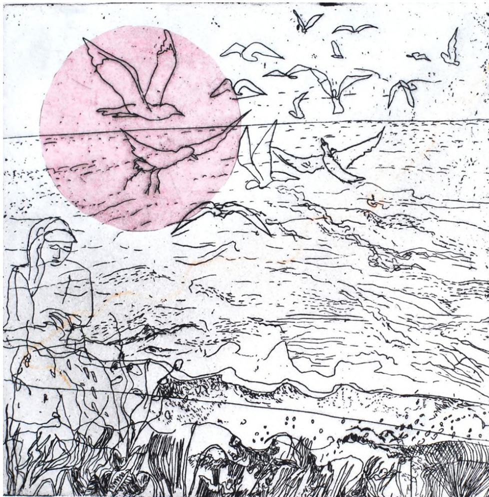
15. Gathering, 2020.