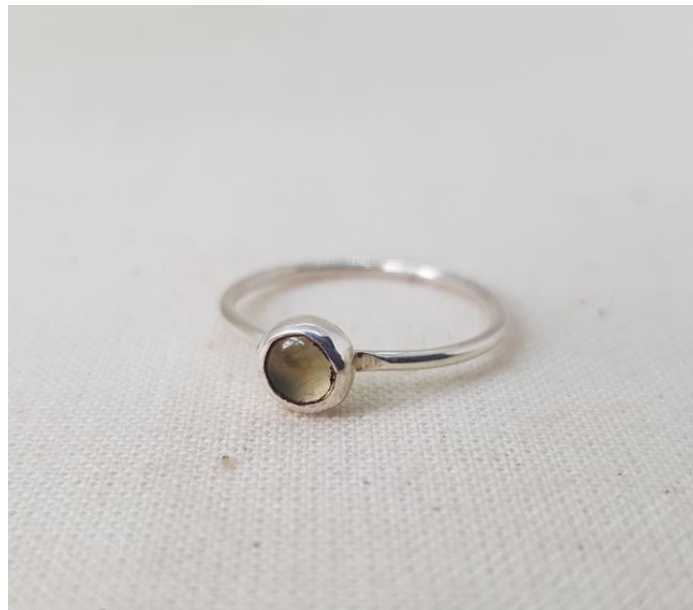
EA30 Prehnite Stackable Ring Size L £57