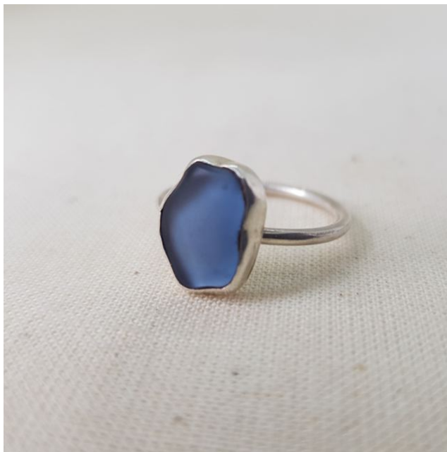
EA34 Light Blue Sea Glass Size M and Half £72