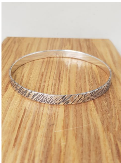
Oxidised Lines Wide Bangle EA77 £103