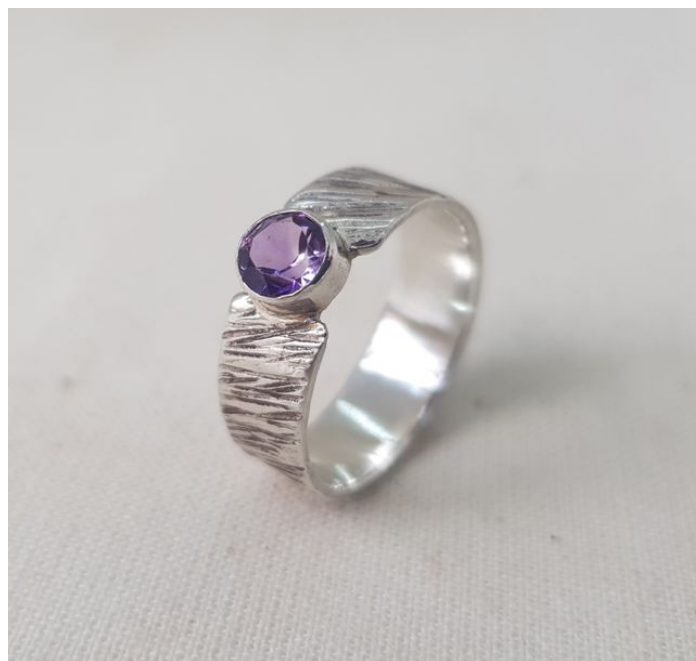
EA48 Amethyst with Lines Wide Band Size M and Half £115