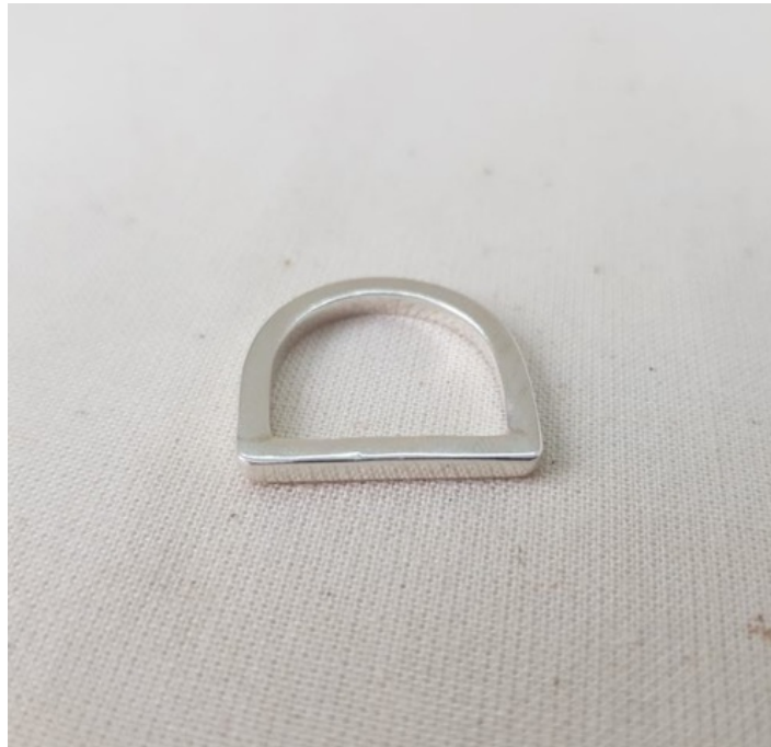
D-Shape Ring EA23 £52