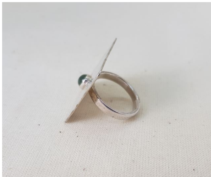
EA43 Hammered Square with Moss Agate Size O and Half £115