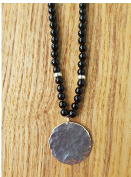
EA63 Onyx Beads with Hammered Pendant £140