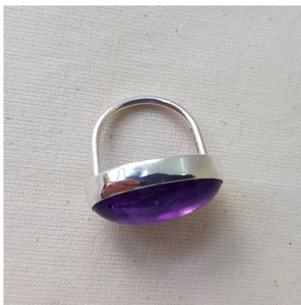
EA40 Large Amethyst Ring Size P £177