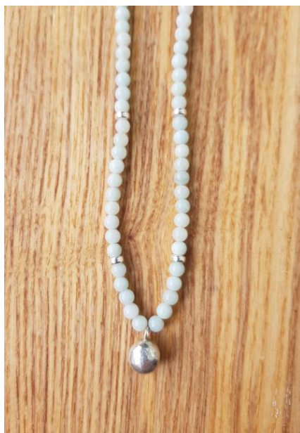
EA62 SOLD Amazonite Beads with Nugget Pendant £140