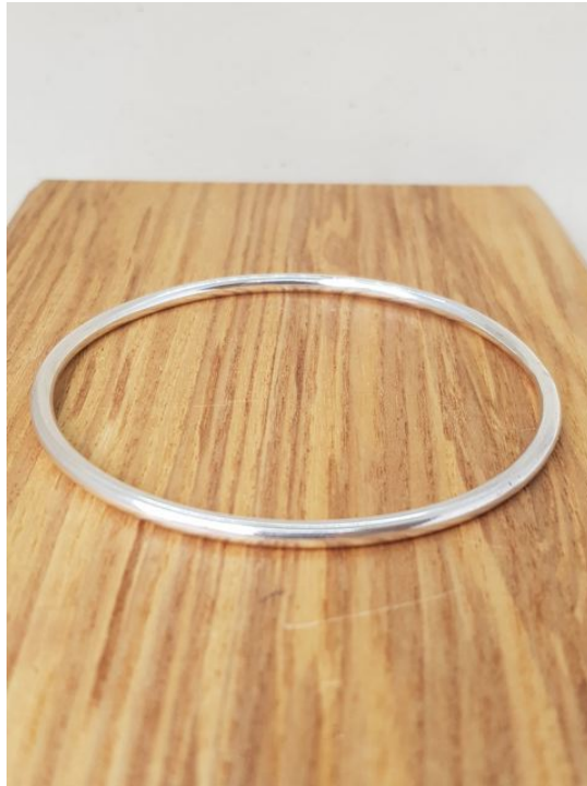
3mm Round Bangle EA75 £88