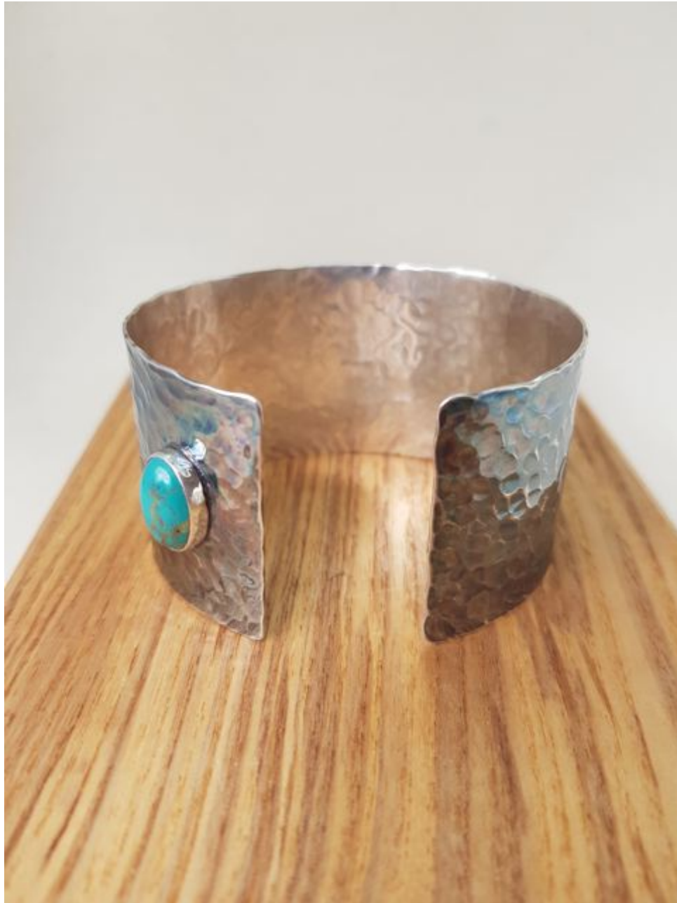
Large Oxidised Hammered 36.5mm Wide Cuff with Turquoise Stone EA81 £277