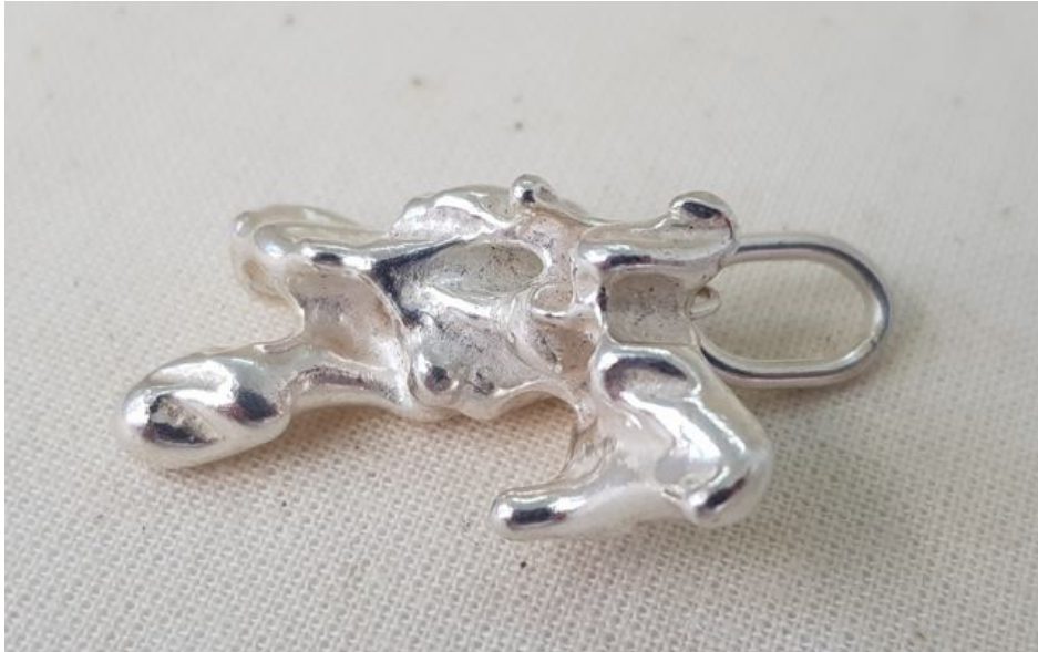
Large Water Cast Birch Twigs Pendant Only EA56 £100