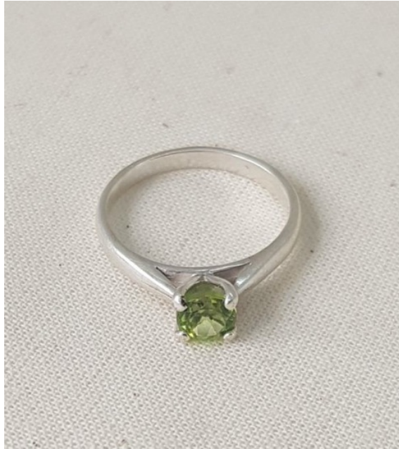
Peridot Claw Setting EA24 £112