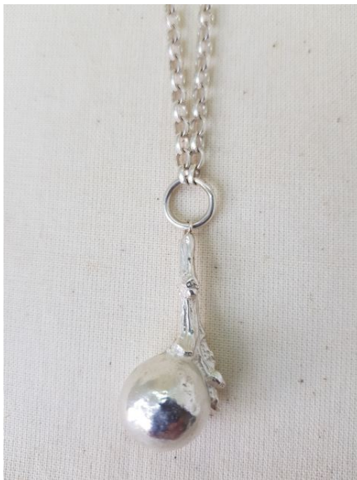
5mm Belcher Chain with Oak Apple EA72 £269