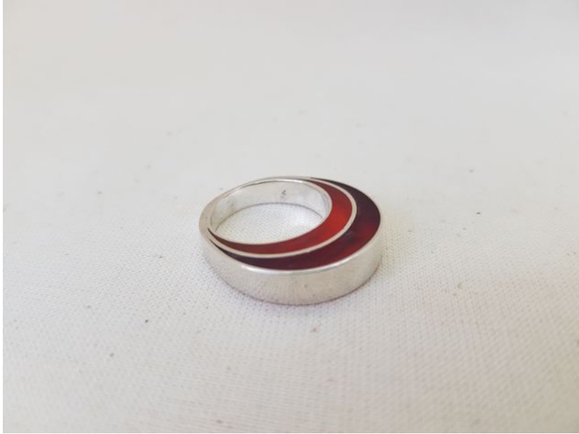
EA45 Red Resin and Silver Ring Size M £92