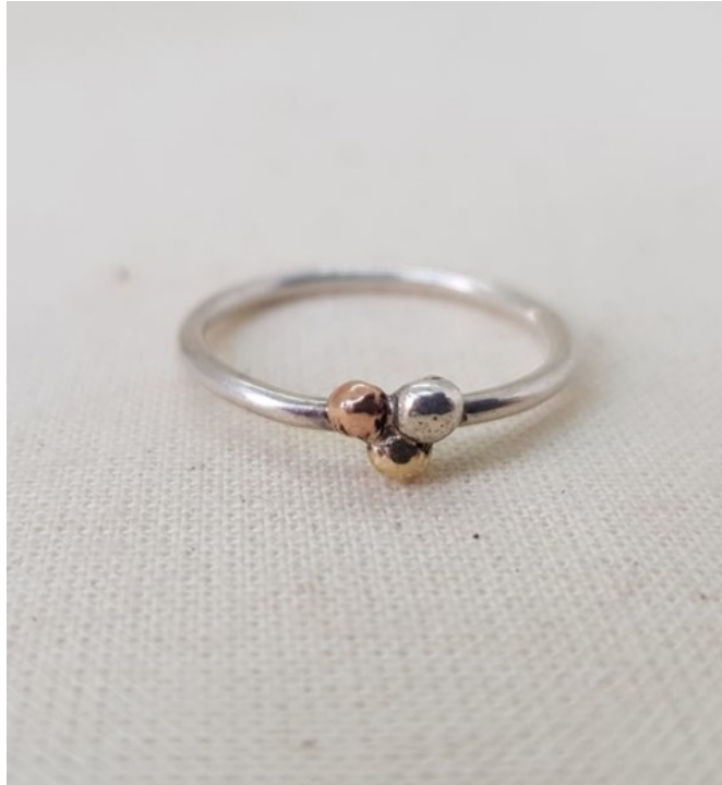
9ct Yellow, 9ct Rose Gold and Silver Cluster Ring EA20 £85