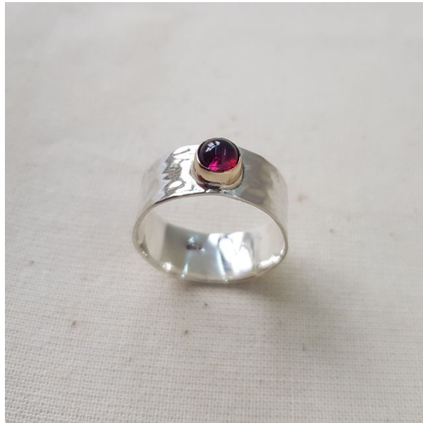
EA38 Garnet 9ct Setting Hammered Band Size P (2) £146