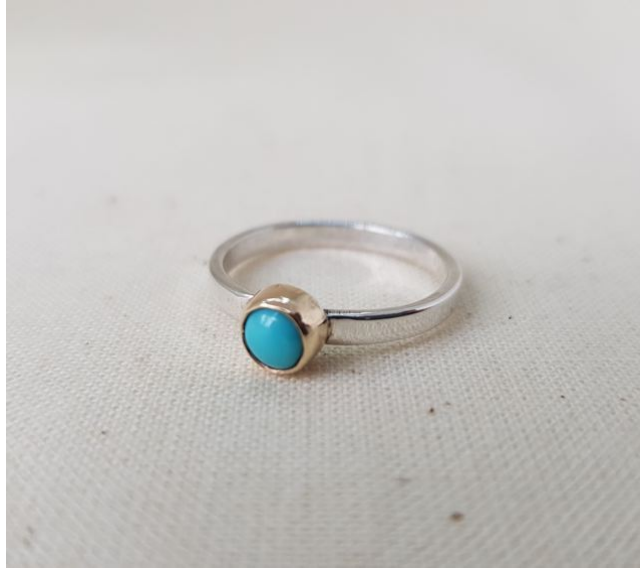
EA37 Turquoise 9ct Setting Size N £115