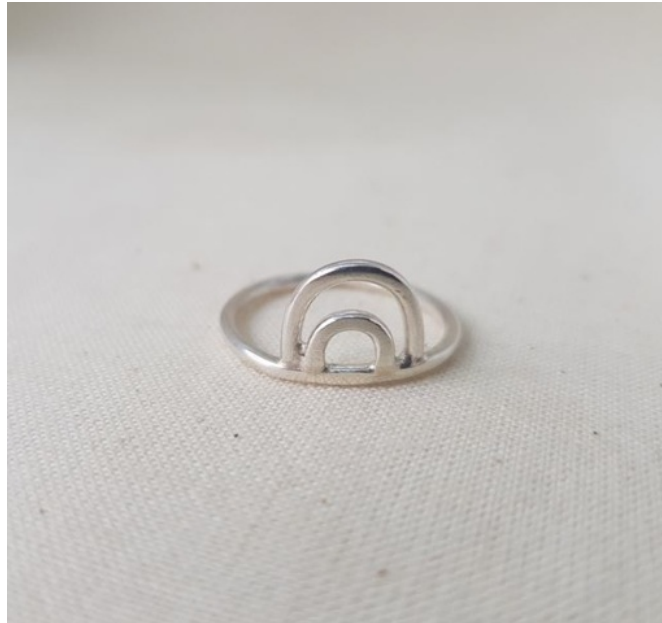
Double Moon Ring EA16 £49