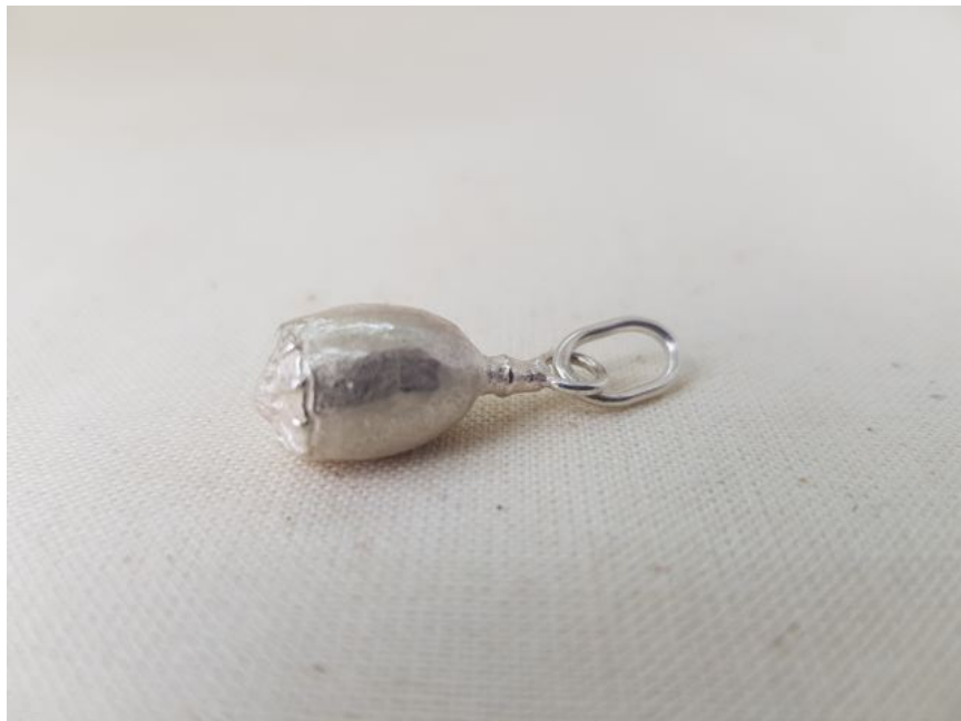
Poppy Pod Pendant only EA61 £88