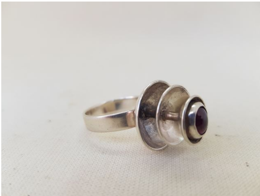
EA46 Multi Disc Ring with Garnet Size M £131