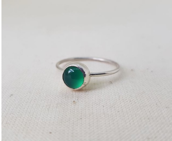
Green Onyx Stackable Ring EA26 £69