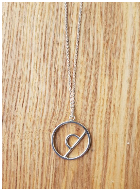
Half Moon Pendant EA50 £80