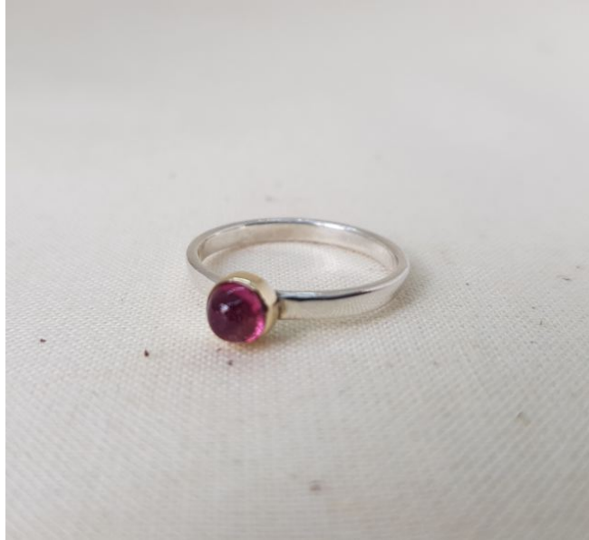
EA35 Pink Garnet Gold Setting Size N £115