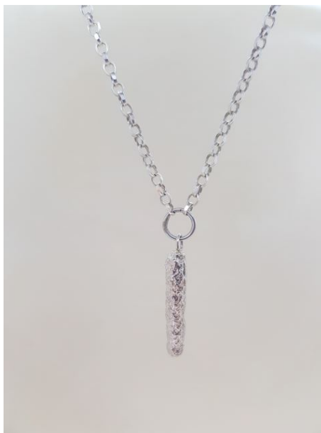
EA66 Catkin 2.3mm Chain £138