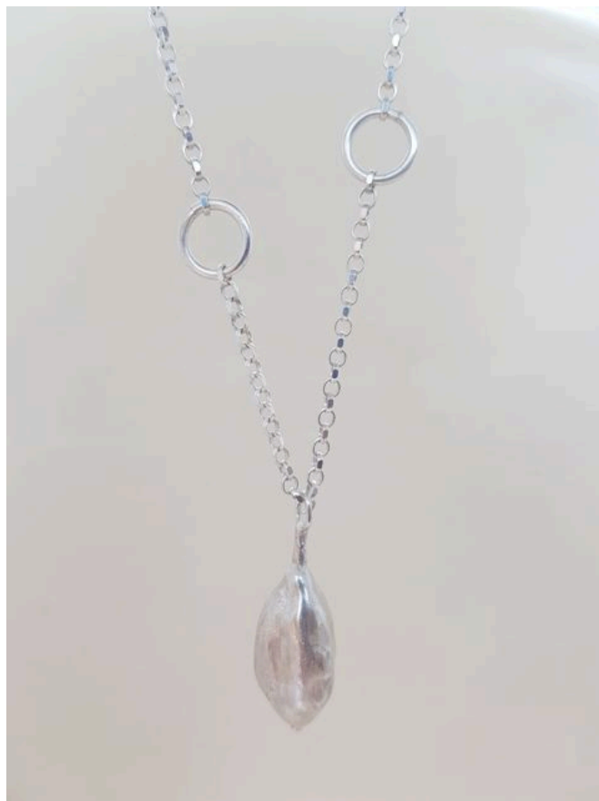
EA70 Alpine Tulip Pod 2.3mm Chain £183