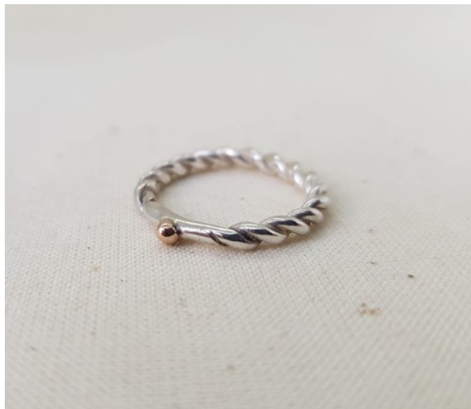
Twisted Ring with 9ct Gold Ball SOLD EA17 £106