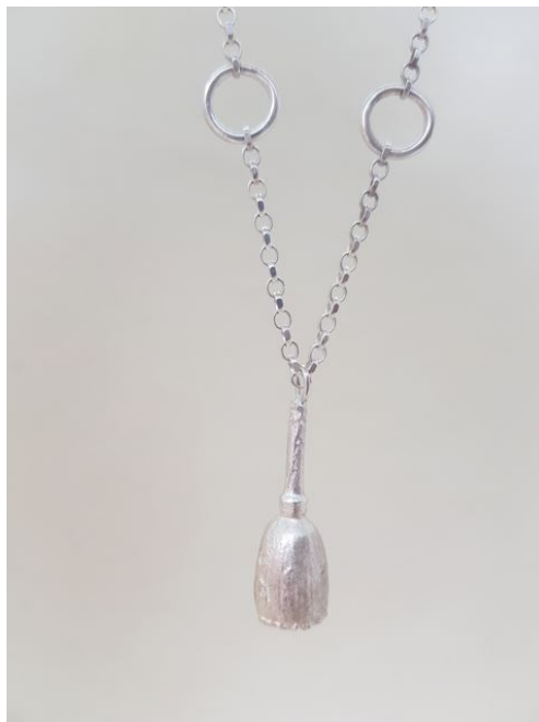
EA69 Poppy Pod 2.3mm Chain £168