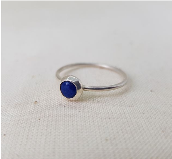
EA29 Lapiz Lazuli Stackable Ring Size N £57