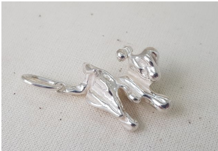
Large Water Cast Birch Twigs Pendant only EA57 £100