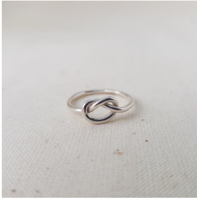
Large Knot Ring EA14 £43