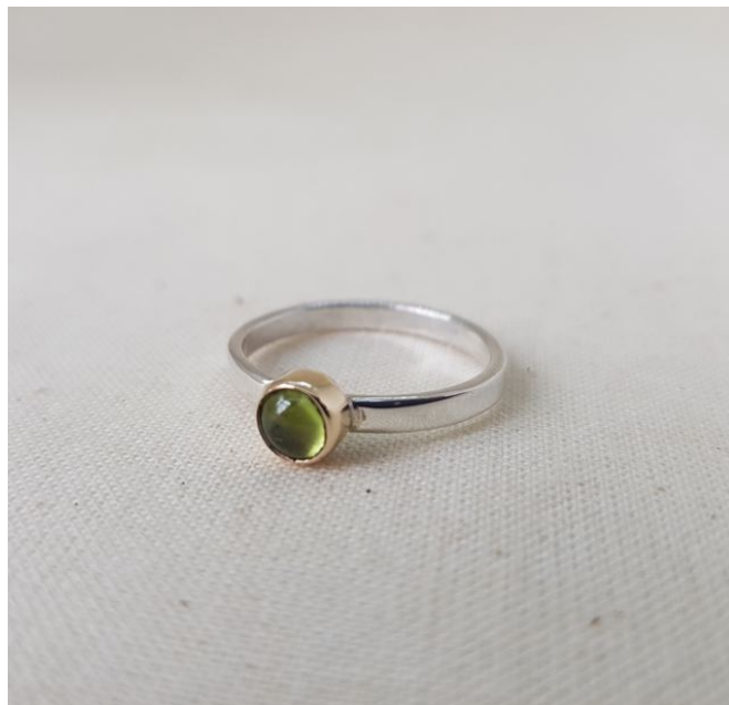
EA36 Peridot 9ct Setting Size N and Half £115