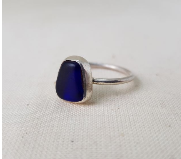
EA33 Dark Blue Sea Glass Ring Size L £72