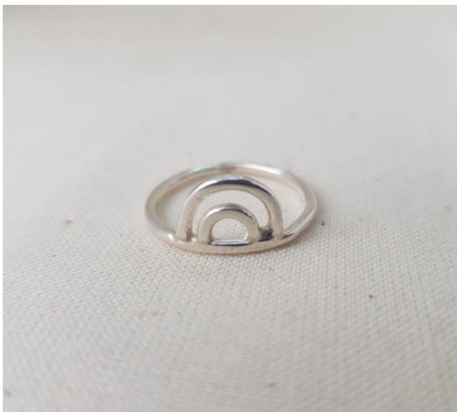
Double Moon Ring EA15 £48