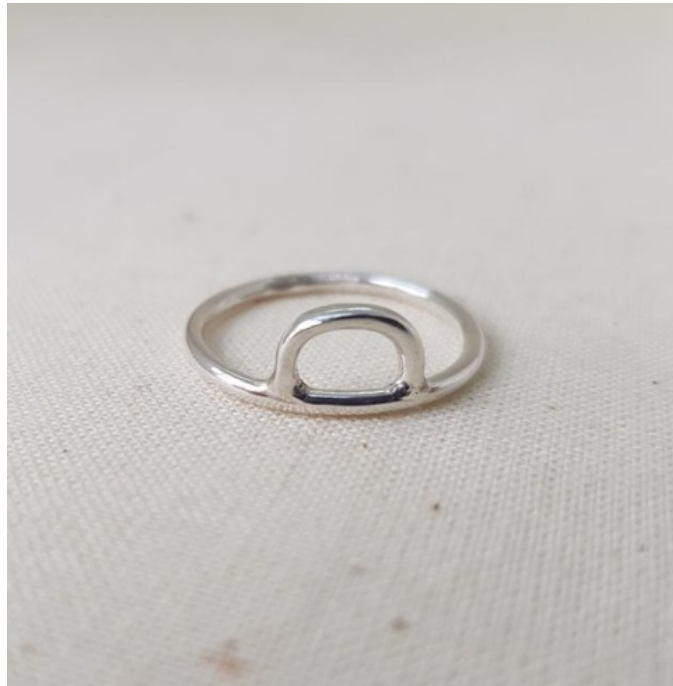
Half Moon Ring EA13 £43