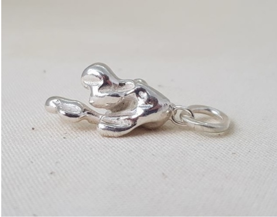
Small Water Cast Birch Twigs Pendant only EA58 £69