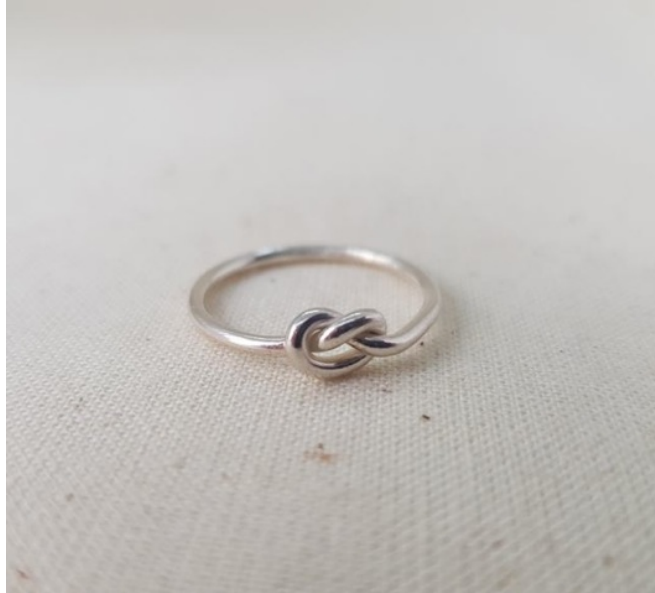
Small Knot Ring EA12 £43