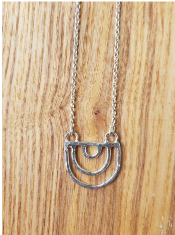
Multi Moon Wire Necklace EA49 £81