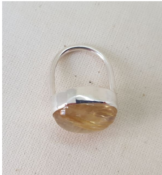
EA41 Side Oval Rutilated Quartz Size N £146