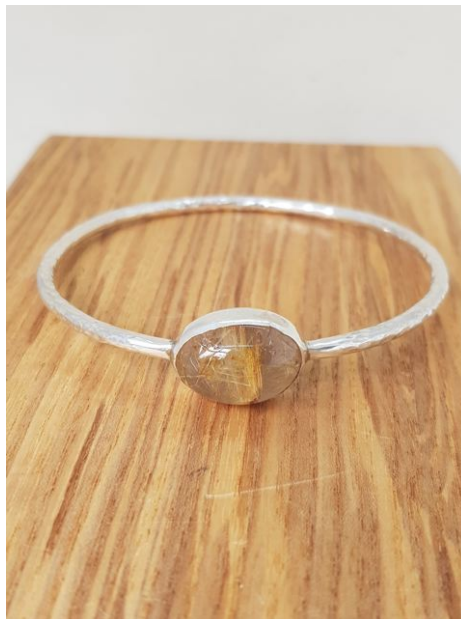
Oval Rutilated Quartz Hammered Bangle EA80 £180