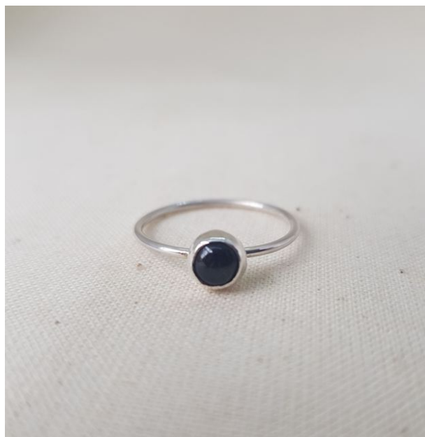
EA3 1 Hematite Stackable Ring Size P £57