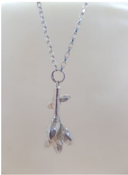
EA65 Oak Twig 2.3mm Chain £169