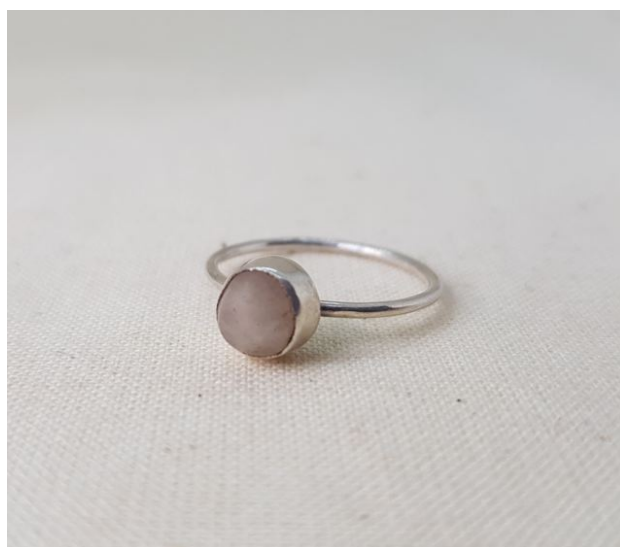
EA3 2 White Sea Pebble Ring Size M £57