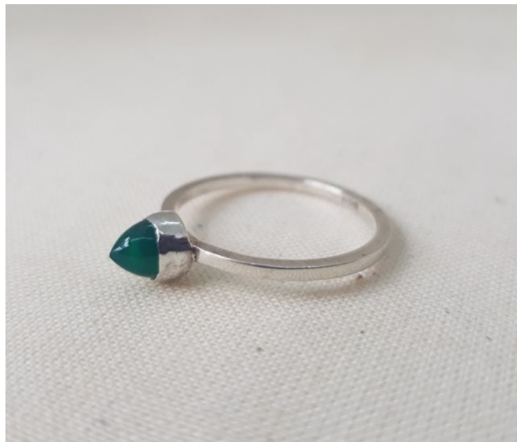
Green Onyx Bullet Ring EA25 £89