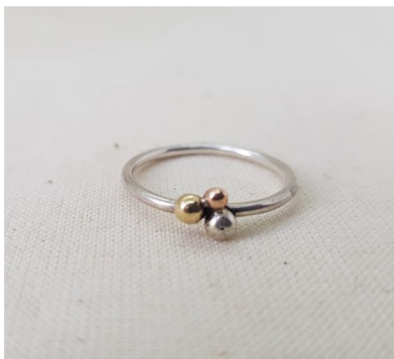
9ct Yellow, 9ct Rose Gold and Silver Cluster Ring EA21 £85