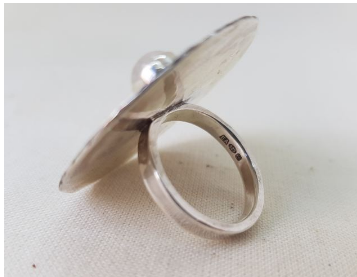
EA44 SOLD Oxidised Hammered Ring with Moonstone Size N and Half £131