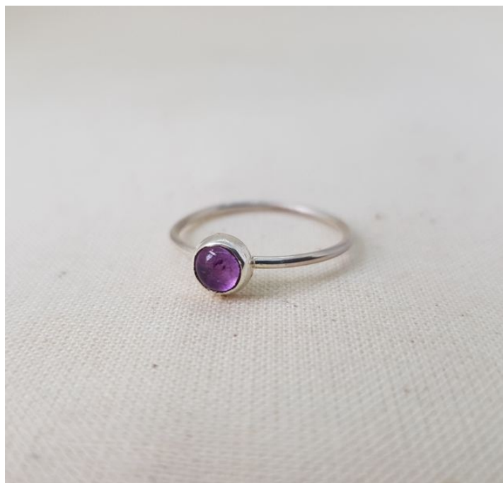
EA27 Amethyst Stackable Ring Size O £57