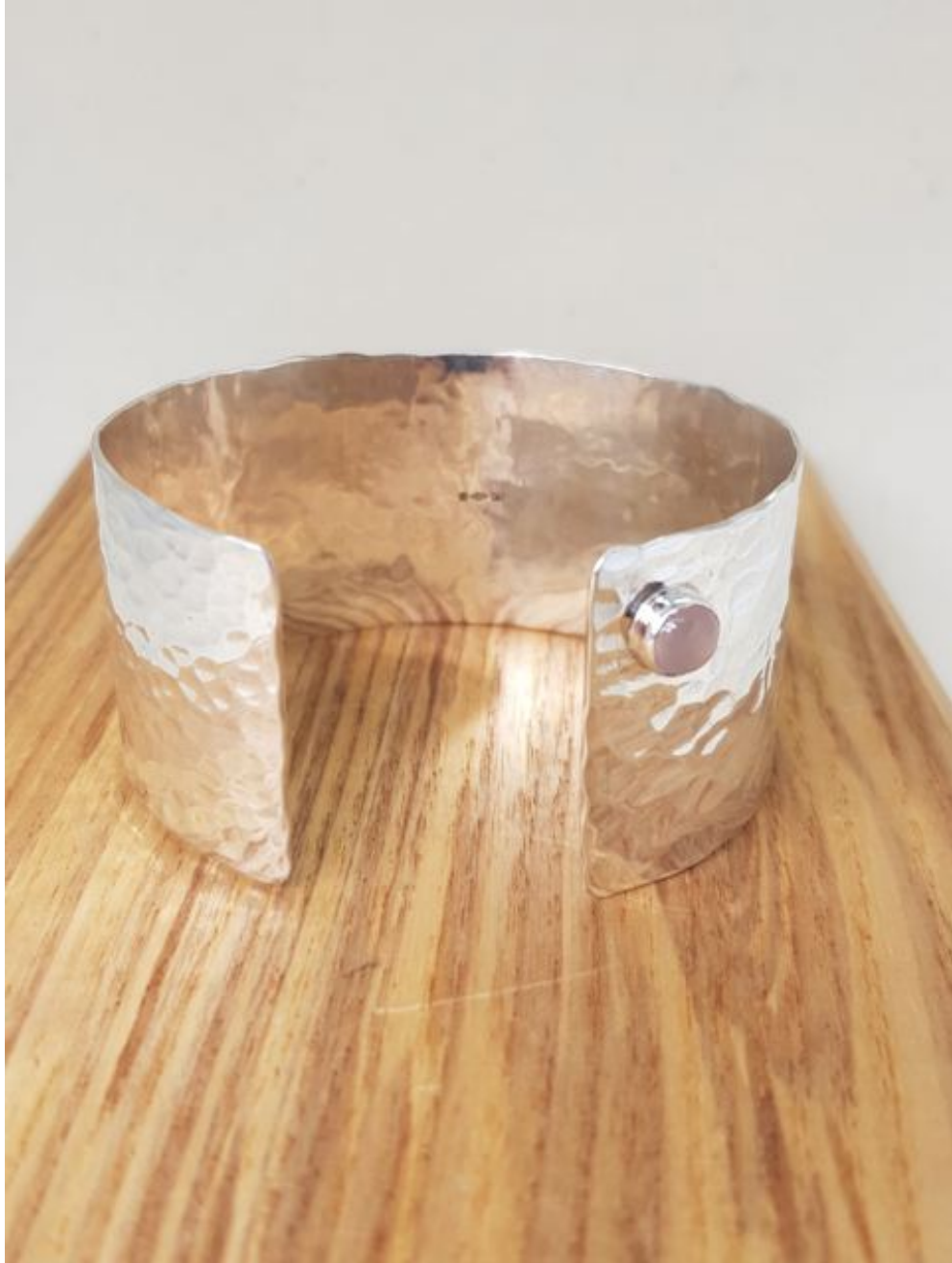
Medium Hammered 31.5mm Wide Cuff with Chalcedony Stone EA82 £223