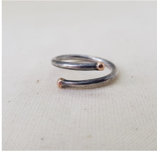
Oxidised Wrap Ring with 9ct Rose Gold Ends EA22 £97