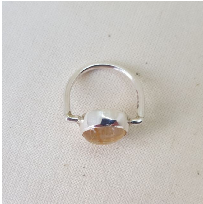
EA42 Rutilated Quartz Ring Size N £138