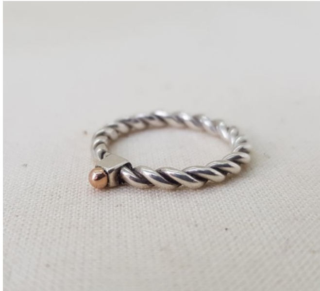
Twisted Ring with 9ct Gold Ball and cube EA18 £106