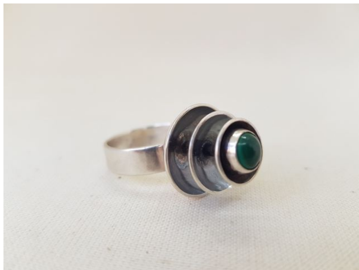
EA47 Multi Disc Ring with Malakite Size M and Half £131