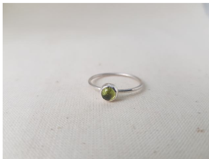
EA28 Peridot Stackable Ring Size N £57