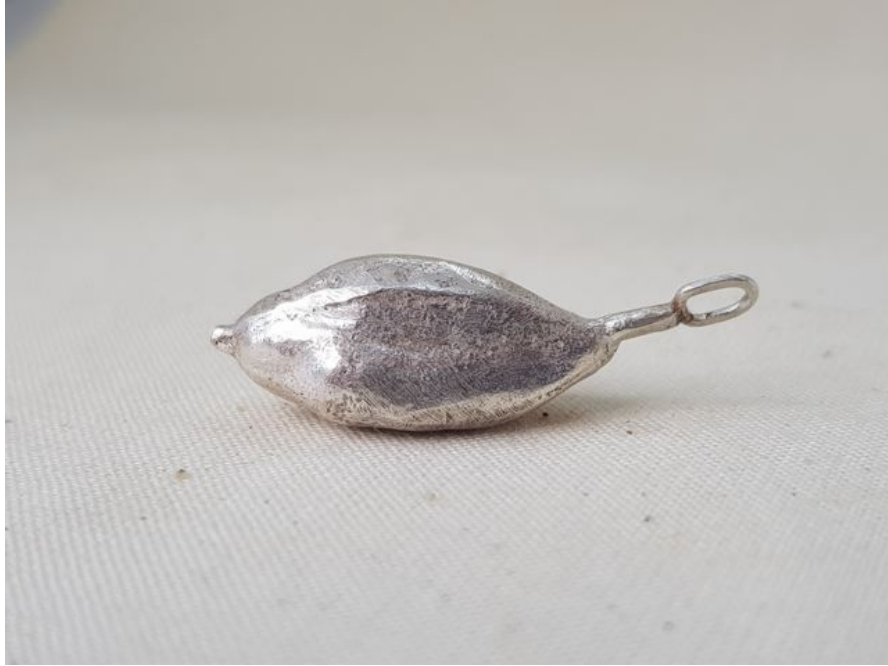
Large Alpine Tulip Pod Pendant only EA60 £103 SOLD