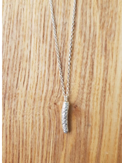
1.4mm Belcher Chain Catkin EA54 £123