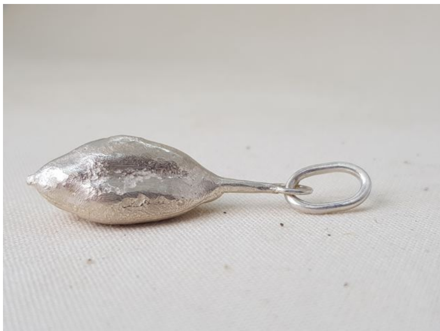
Large Alpine Tulip Pod Pendant only EA59 £103