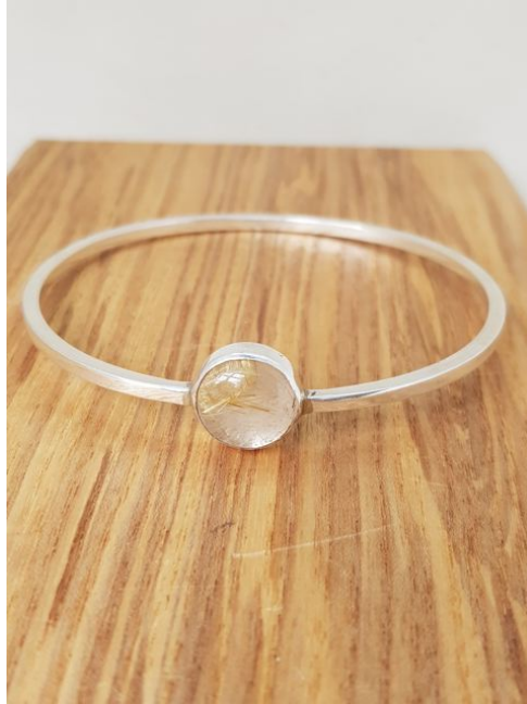
Round Rutilated Quartz Square Bangle EA79 £164