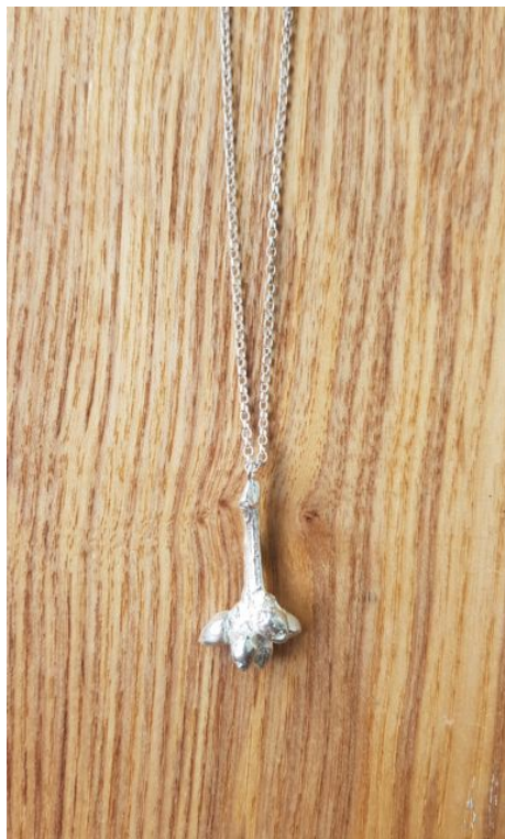
1.4mm Belcher Chain Oak Twig EA55 £143