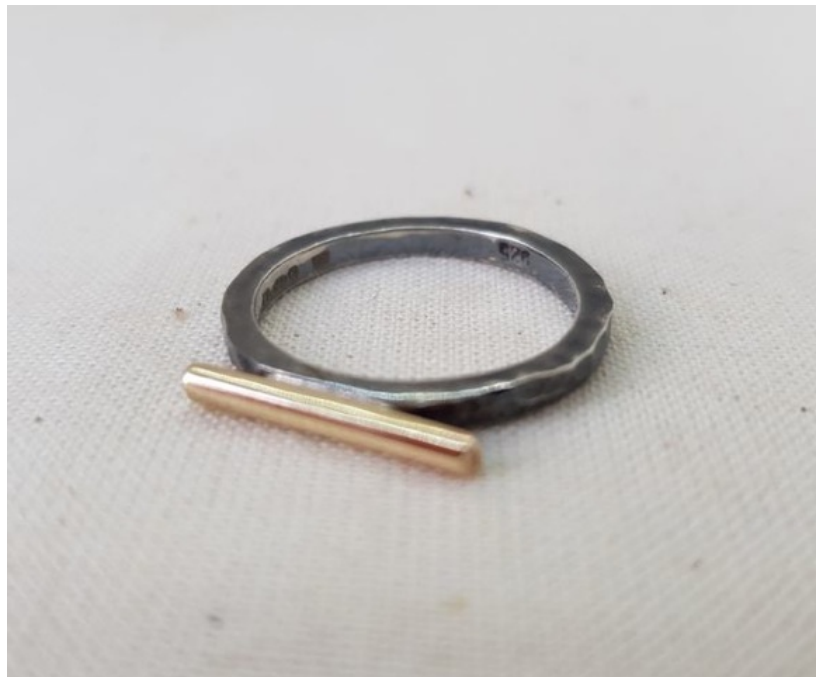
Oxidised Hammered Band with 9ct Gold Bar EA 19 £135