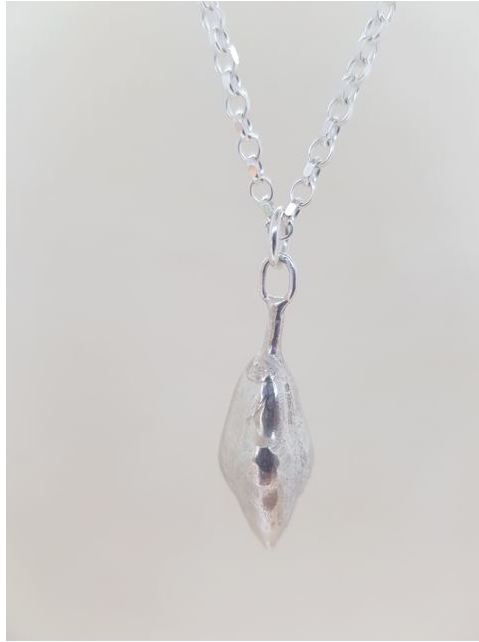
EA68 Alpine Tulip Pod 2.3mm Chain £154