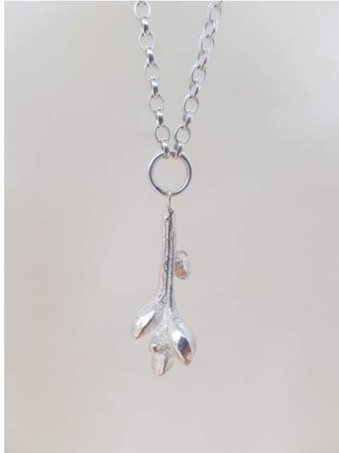
5mm Belcher Chain with Oak Twig EA71 £269