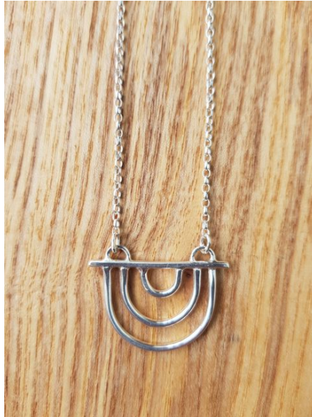
Multi Moon Wire Necklace EA52 £81