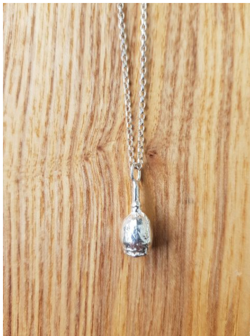
1.4mm Belcher Chain Small Poppy Pod EA53 £123