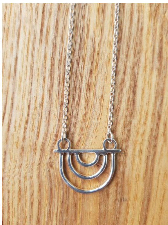
Multi Moon Wire Necklace EA51 £81