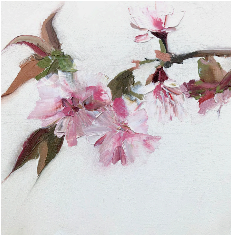
Prunus Matsumae Fuki , 2020

This new catalogue contains her second group of blossom paintings and includes the Taihaku , Hokusai , Okame and Asano varieties.