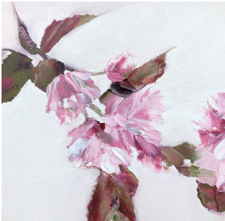
Prunus Hokusai, 2020

Amazingly, Ingram's 'love affair' with cherry blossoms was triggered in the spring of 1920 by the sight of two mature Japanese cherry trees at The Grange that the first Earl of Cranbrook most likely planted. Ingram later named the trees Hokusai .