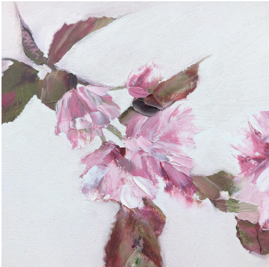
Prunus Hokusai, 2020. Oil on board.