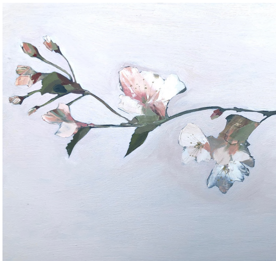
Prunus Taihaku IV, 2020