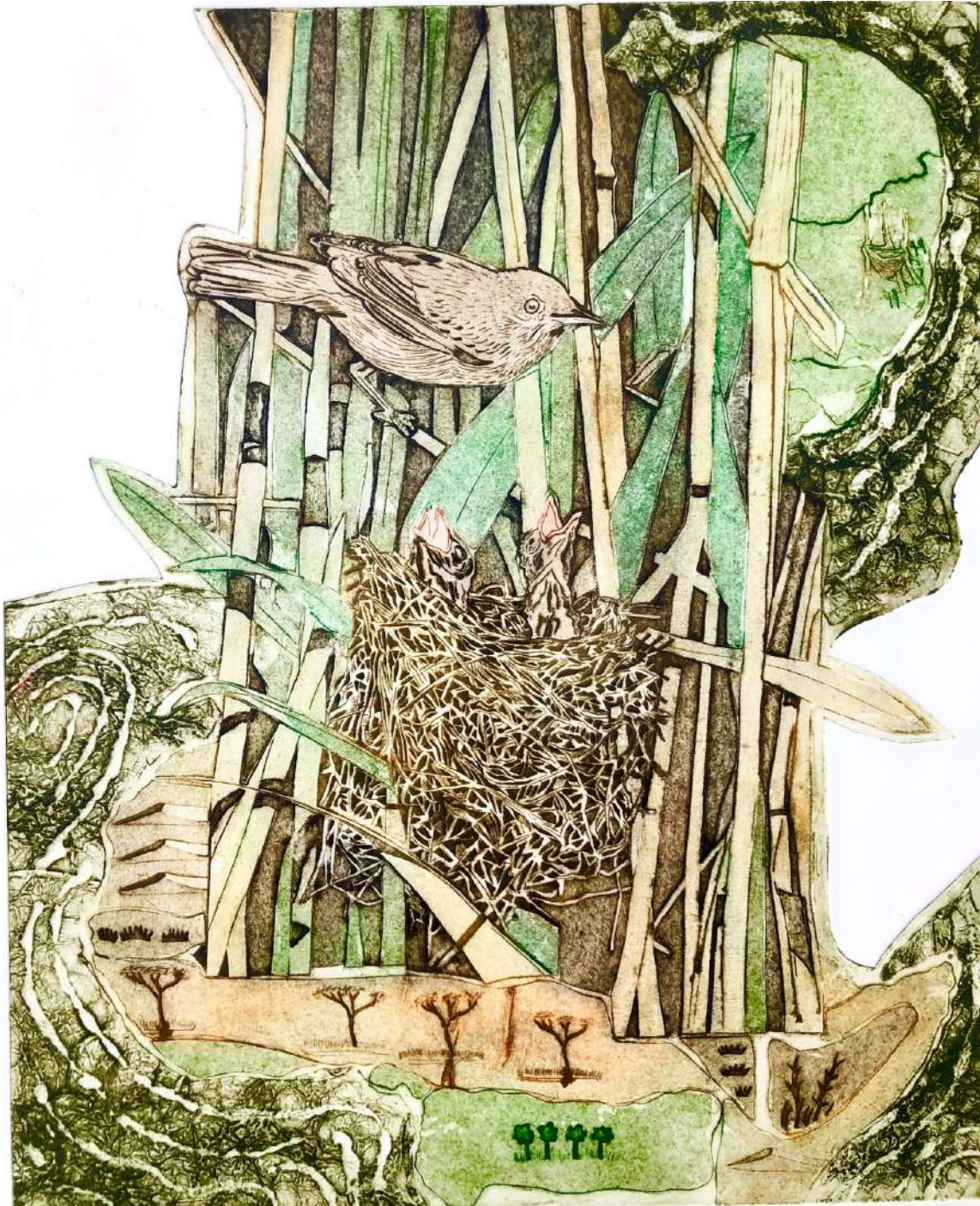
21. Reed Warbler's Nest , 2020. Collagraph print; unique. Ghost Print I. Unique. H615mm W545mm £975 (framed)