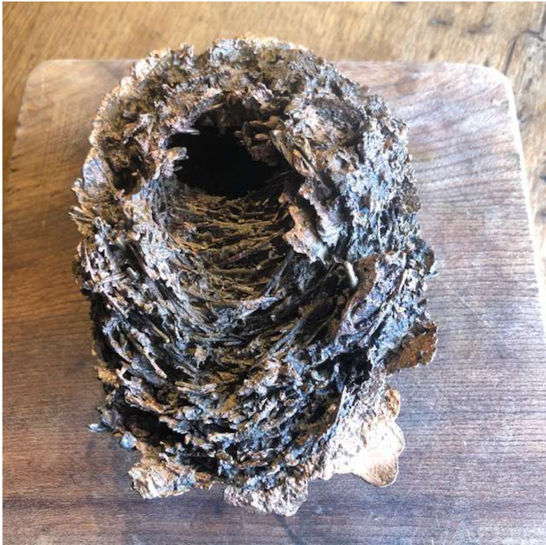
6. Wren's Nest (Debenham, Garden) . 2020. Unique bronze. H80mm L170mm W115mm. £850