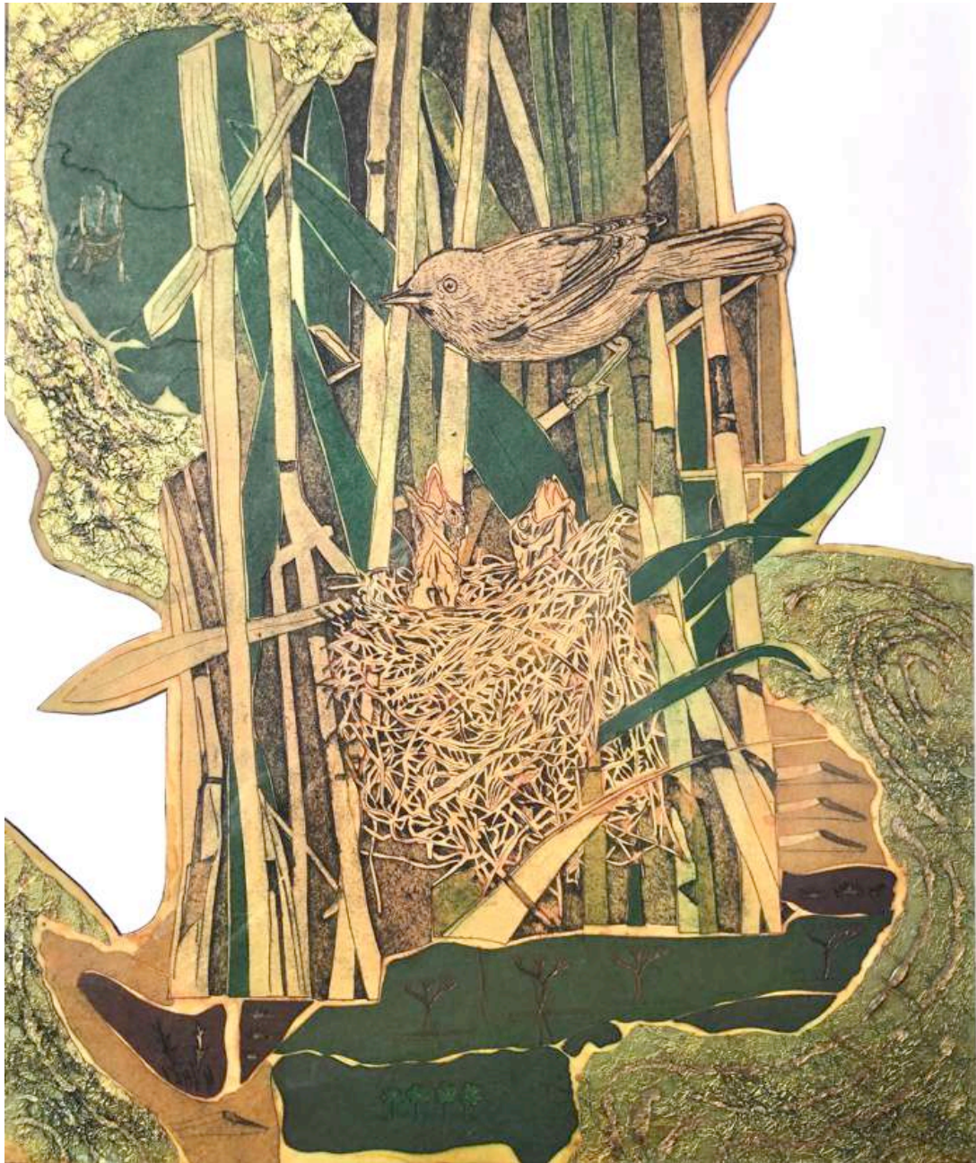
19. Reed Warbler's Nest, 2020. Collagraph Plate. Unique. H615mm W545mm £1,850 (framed)