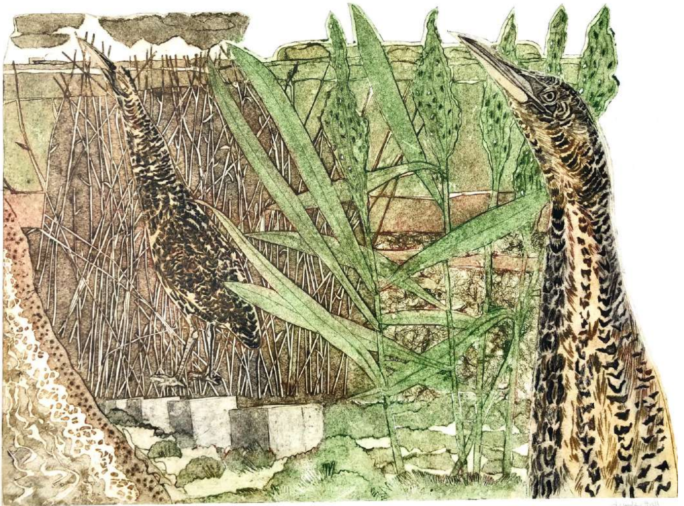
Bittern at Minsmere. A wetland bird found in marshland, shallow water and reed beds.