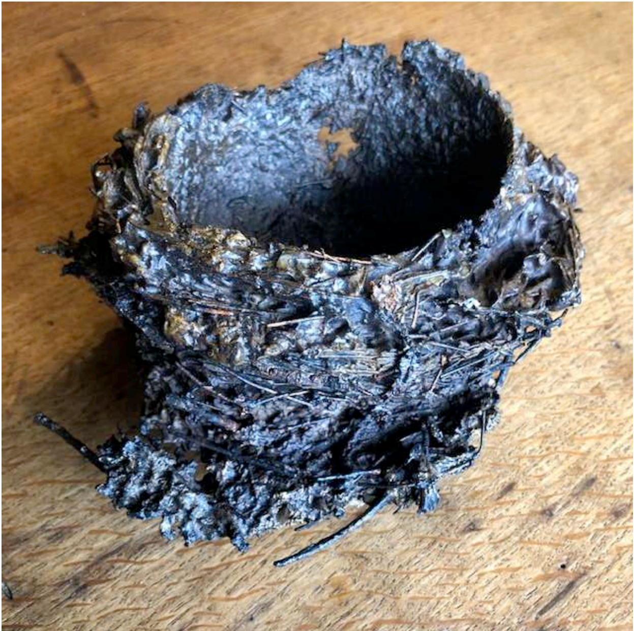
1. Blackbird's Nest (Sweffling, Hedgerow) . 2020. Unique bronze. H85mm L165mm W85mm £850