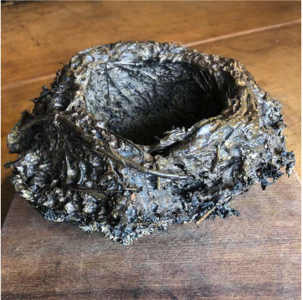
2. Blackbird's Nest (Ufford, Garden) . 2020. Unique bronze. H90mm L170mm W165mm £1,650