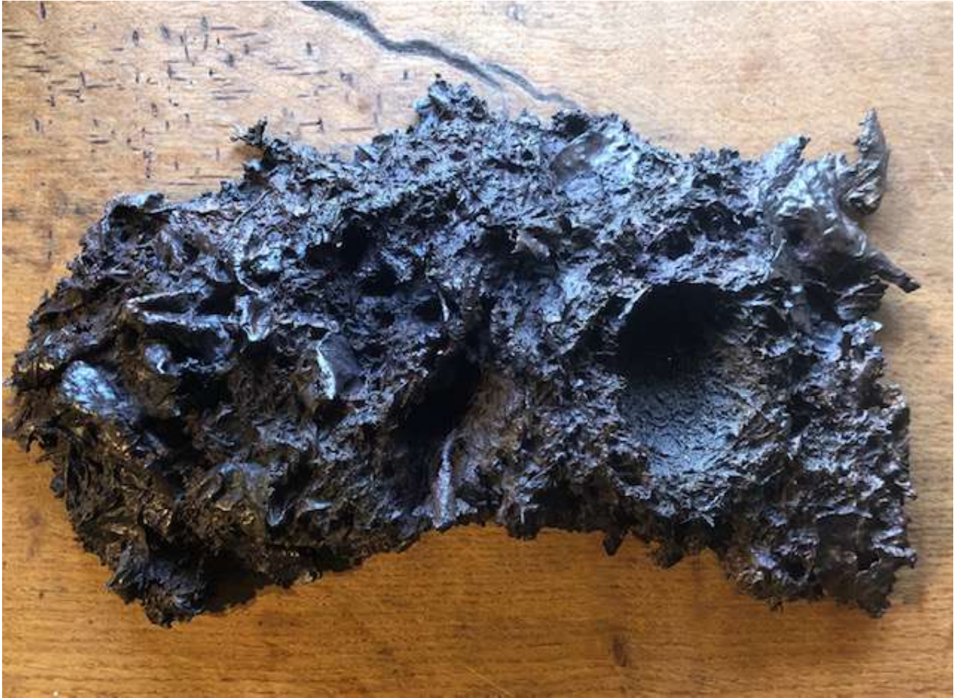
5. Robin's Nest (Alderton, Garage) . 2020. Unique bronze. H80mm L420mm W260mm. £2,450