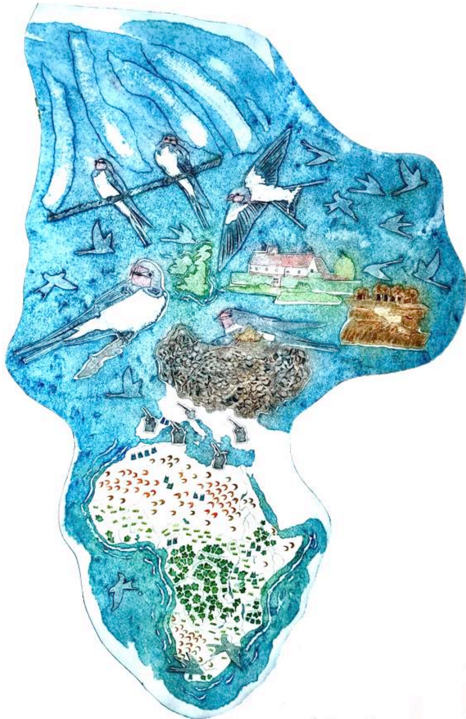
Migrating Swallows arrive from South Africa in April and May, a sign of Summer. Leanne Hall

24. Swallow, Migration. 2020. Collagraph print. Unique. Lightly Inked H860mm W615mm £1,135 (framed)