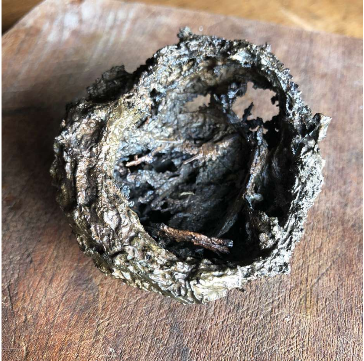
9. Small nest (Dark Brown) . 2019. Unique bronze. H55mm L90mm W75mm. £325