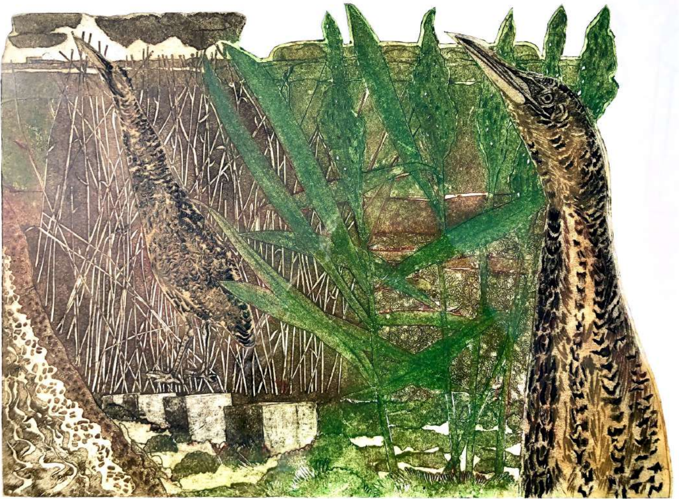
16. Bittern, Minsmere, 2020. Collagraph print; unique. Heavily inked. H235mm W725mm £1,135 (framed)