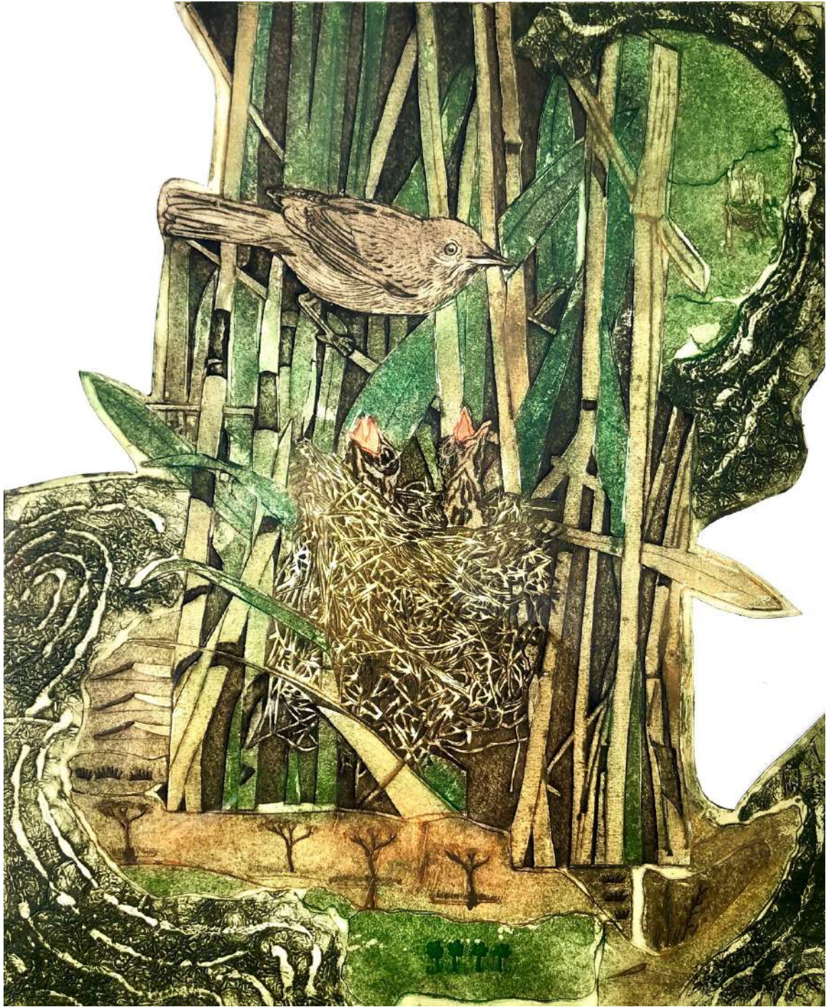
20. Reed Warbler's Nest , 2020. Collagraph print; unique. Heavily inked. H615mm W545mm £975 (framed)