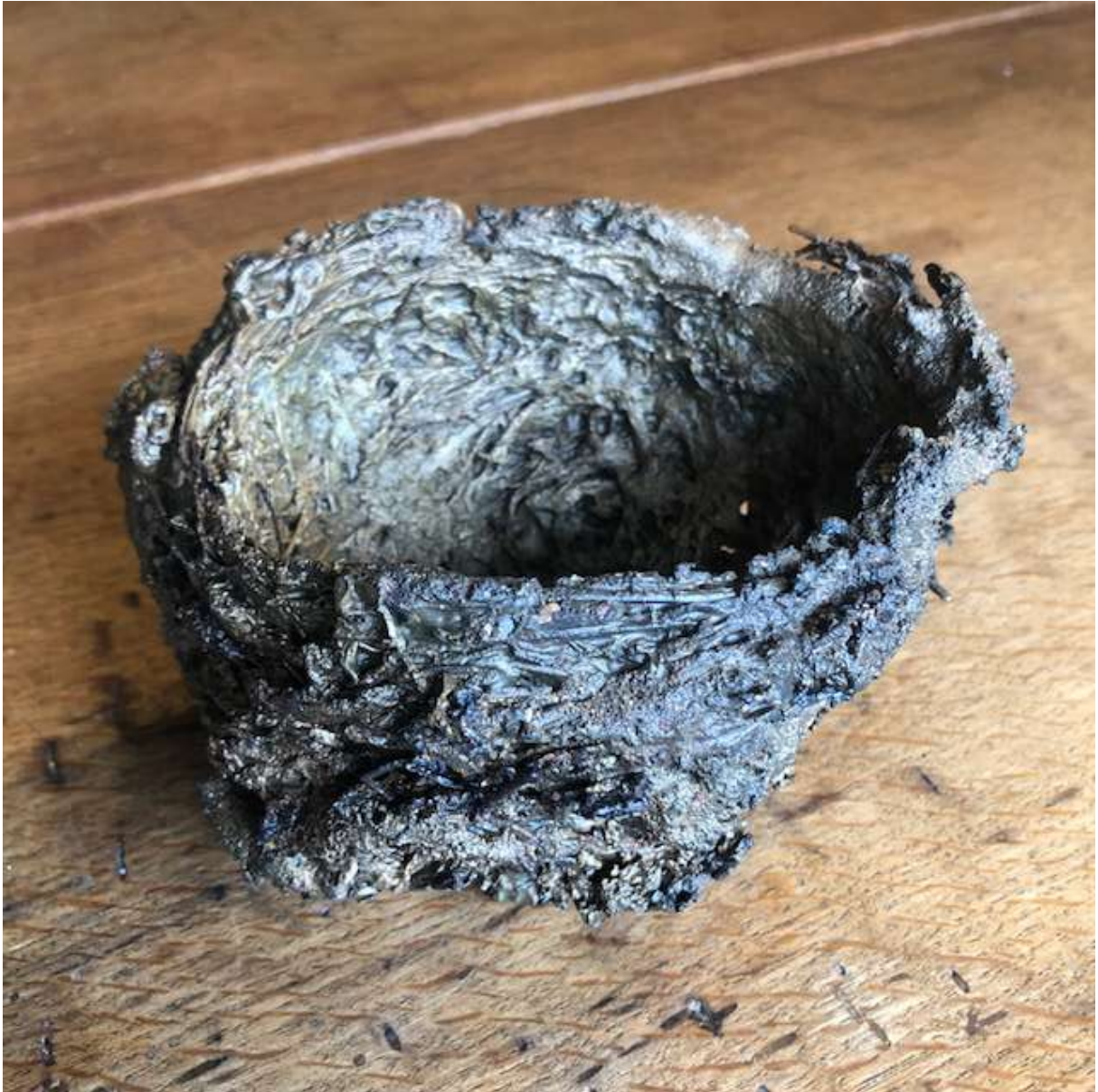
4. Blackbird's Nest (Ufford, Garden). 2020. Unique Bronze. H95mm L150mm W130mm £850