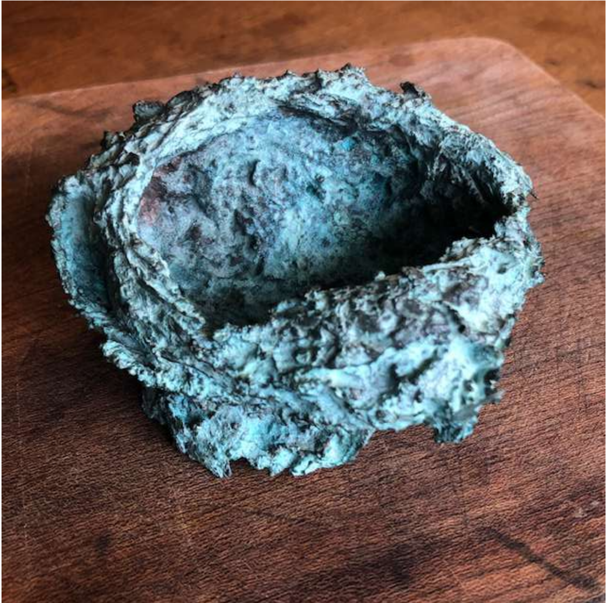
8. SOLD Small Nest (Green) . 2019. Unique bronze.] H50mm L100mm W90mm. £395