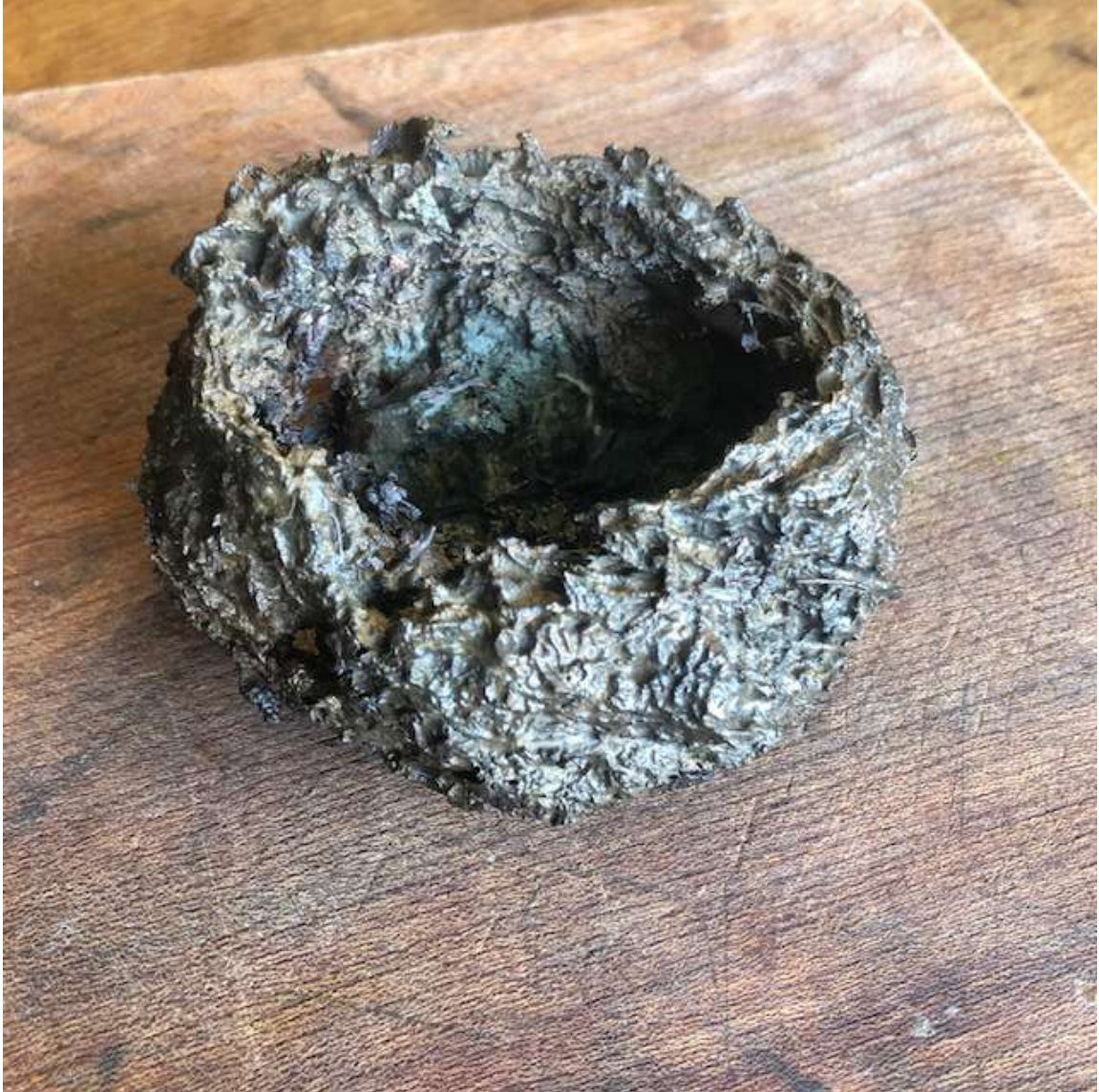
7. Small Nest I (Dark brown, Green Patination) . 2020. Unique bronze. H50mm L85mm W95mm. £395