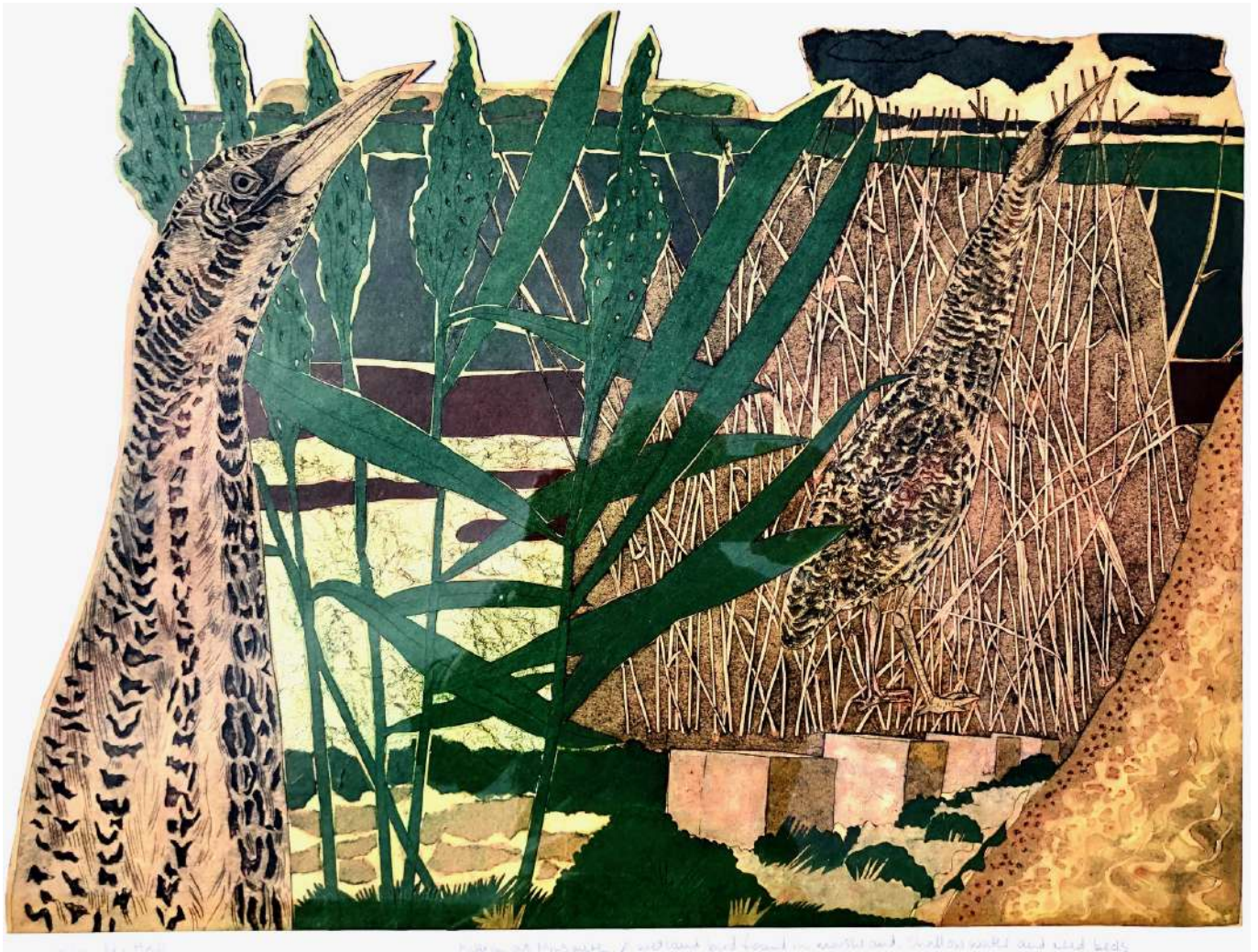
15. Bittern, Minsmere, 2020. Collagraph Plate. Unique. H235mm W725mm £2,115 (framed)