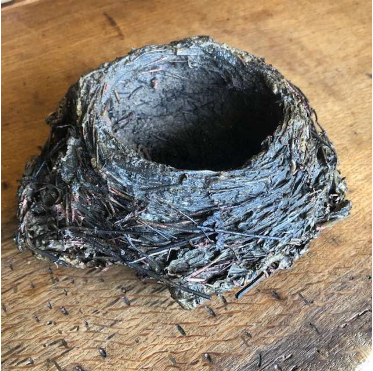
3. Blackbird's Nest (Butley, Barn) . 2020.