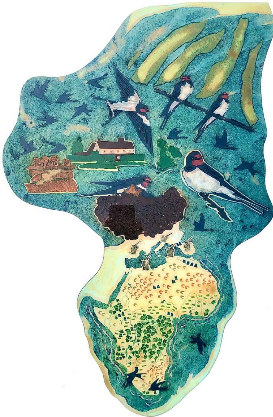
22. Swallow, Migration. 2020. Collagraph Plate. Unique. H860mm W615mm £2,115 (framed)