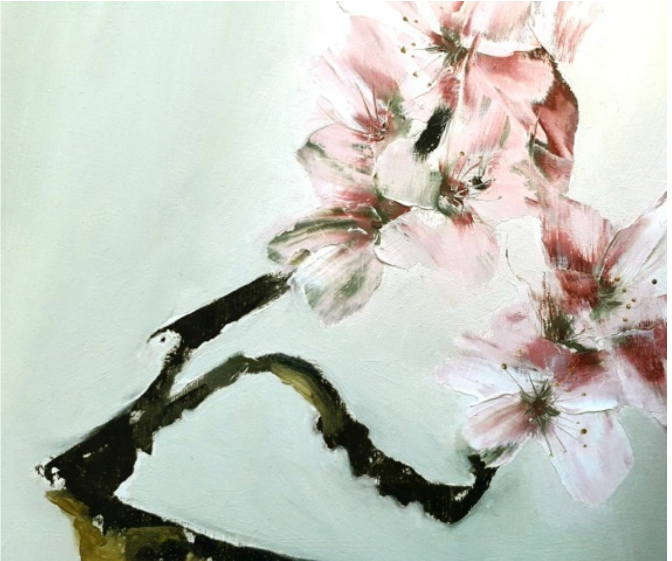
8. Nectarine 2 (Glass House, Walled Garden)

Oil on Board H150mm W150mm £395 (framed)