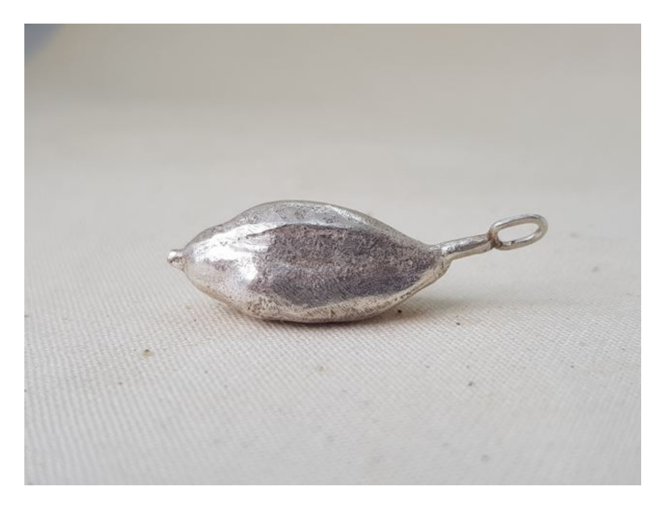
Large Alpine Tulip Pod Pendant only EA60 £103 SOLD