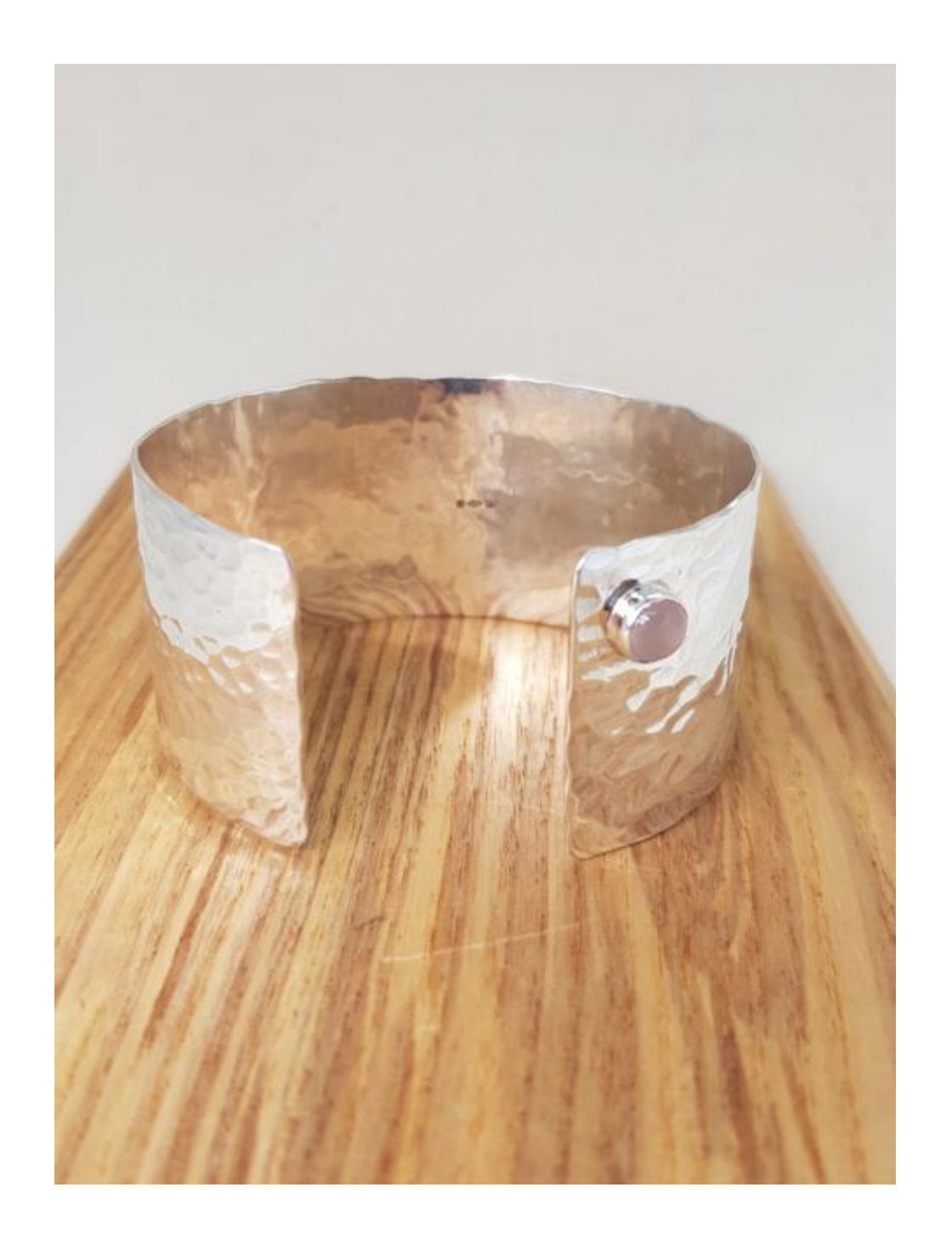
Medium\ Hammered\ 31.5mm\ Wide\ Cuff\ with\ Chalcedony\ Stone\ EA82\ \ \pounds 223