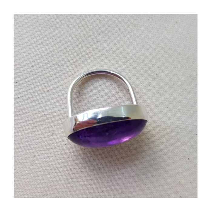
EA40 Large Amethyst Ring Size P \mathfrak{L}_{177}