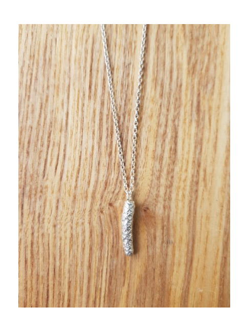
1.4mm Belcher Chain Catkin EA54 £123