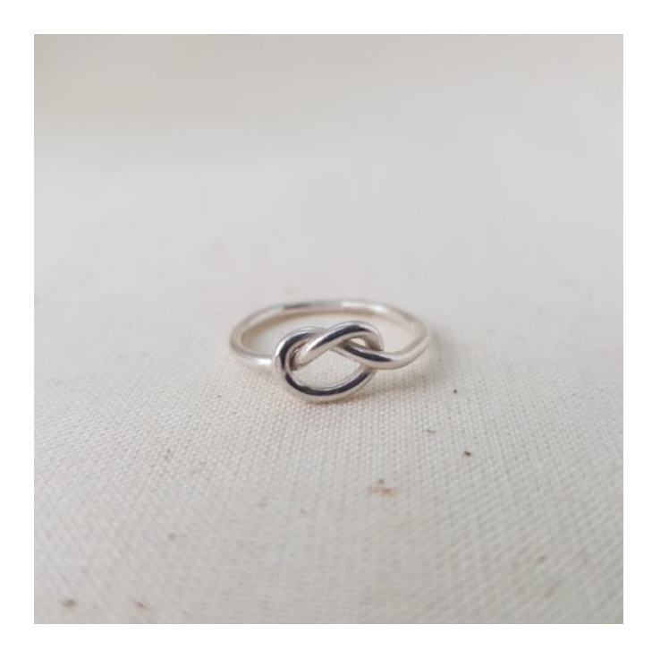
Large Knot Ring EA14 £43