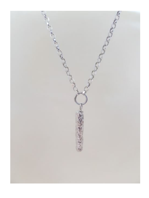
EA66 Catkin 2.3mm Chain £138