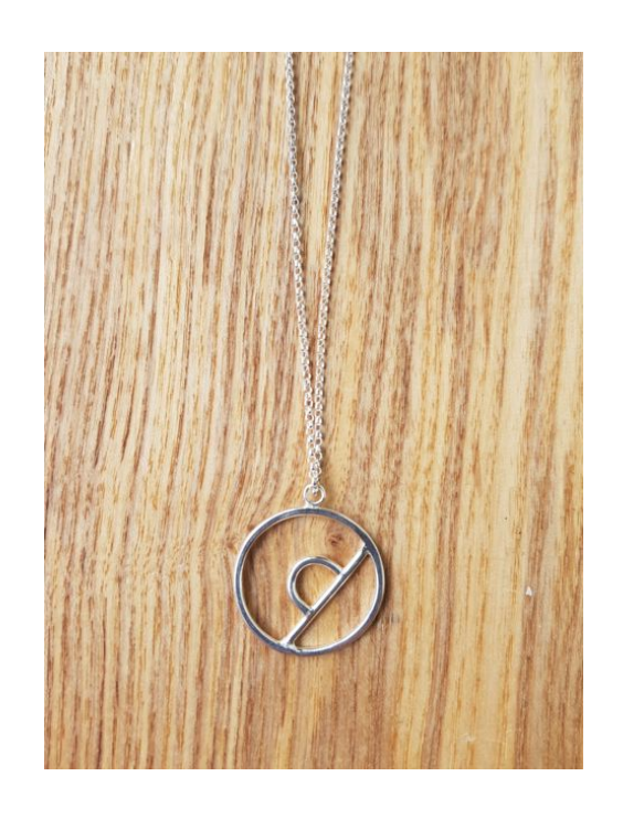
Half Moon \ Pendant \ EA50 \ \pounds 80