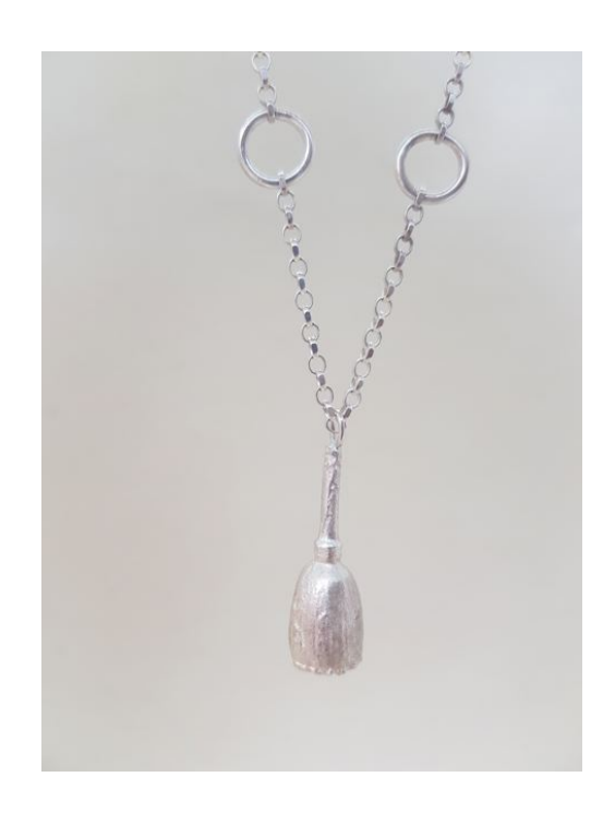
EA69 Poppy Pod 2.3mm Chain £168