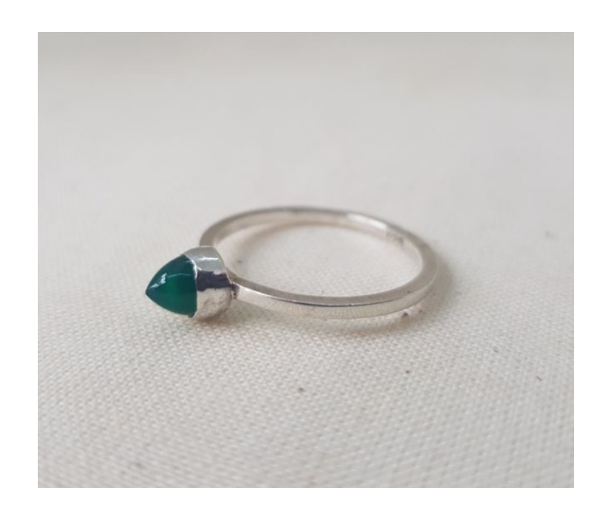
Green Onyx Bullet Ring EA25 £89