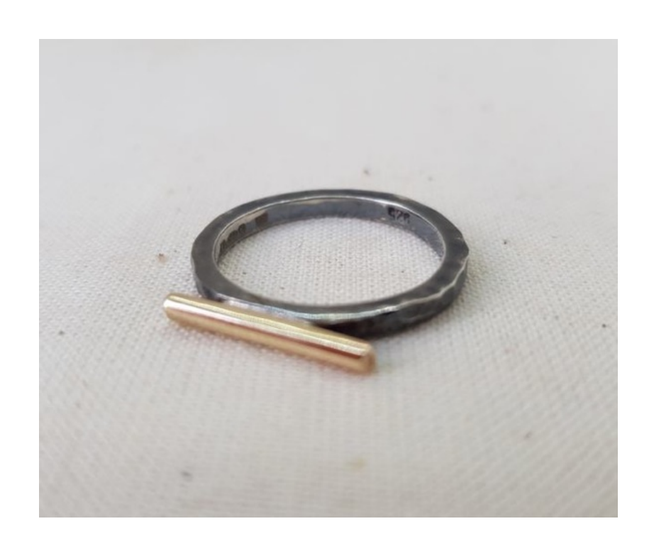
Oxidised Hammered Band with 9ct Gold Bar EA 19 £135