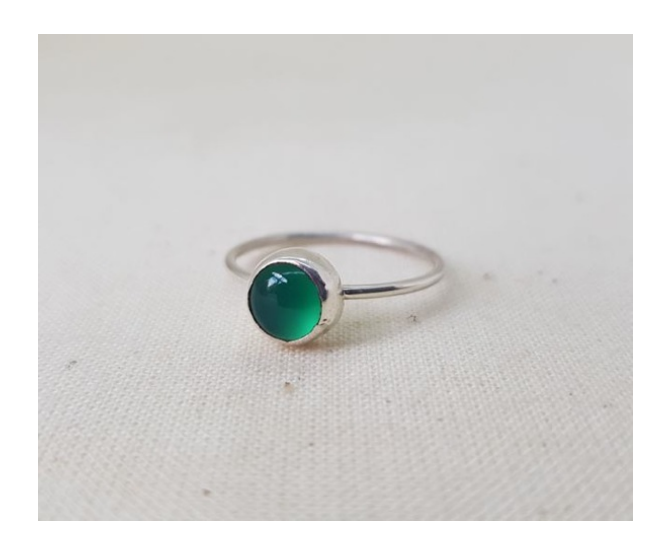
\textit{Green Onyx Stackable Ring EA26} \ \pounds 69