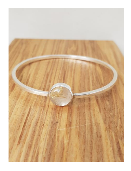
Round Rutilated Quartz Square Bangle EA79 £164