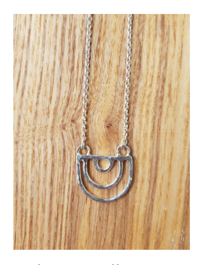
Multi Moon Wire Necklace EA49 £81