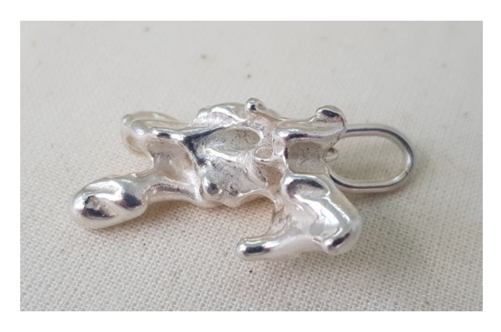
Large Water Cast Birch Twigs Pendant Only EA56 £100