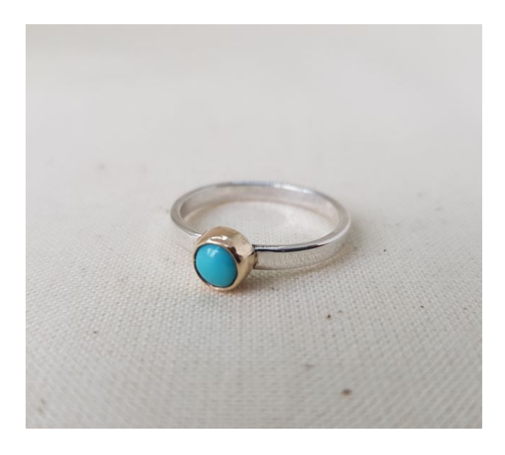
EA37 Turquoise 9ct Setting Size N \, £115