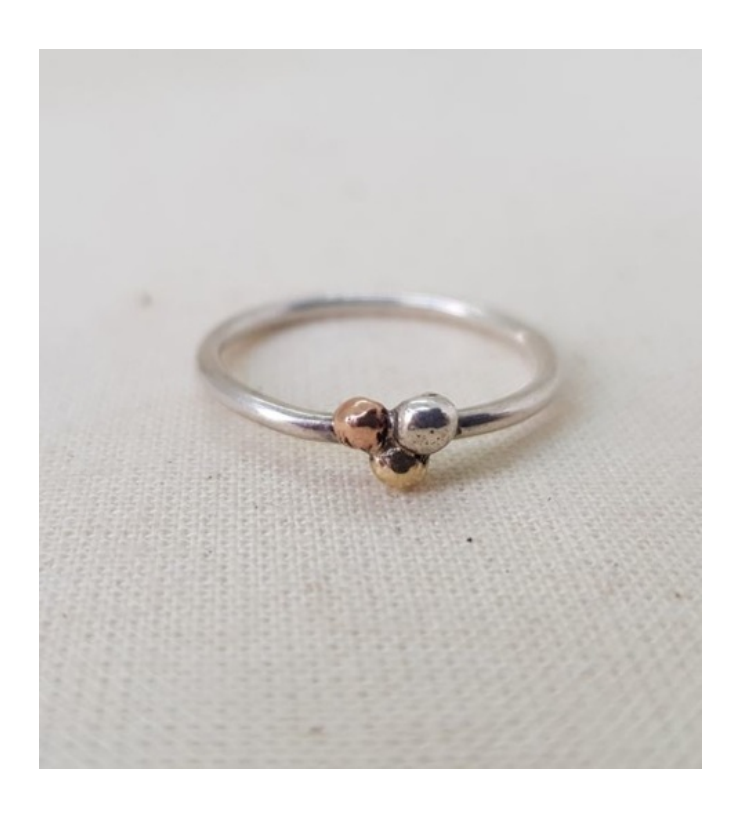
9ct Yellow, 9ct Rose Gold and Silver Cluster Ring EA20 £85