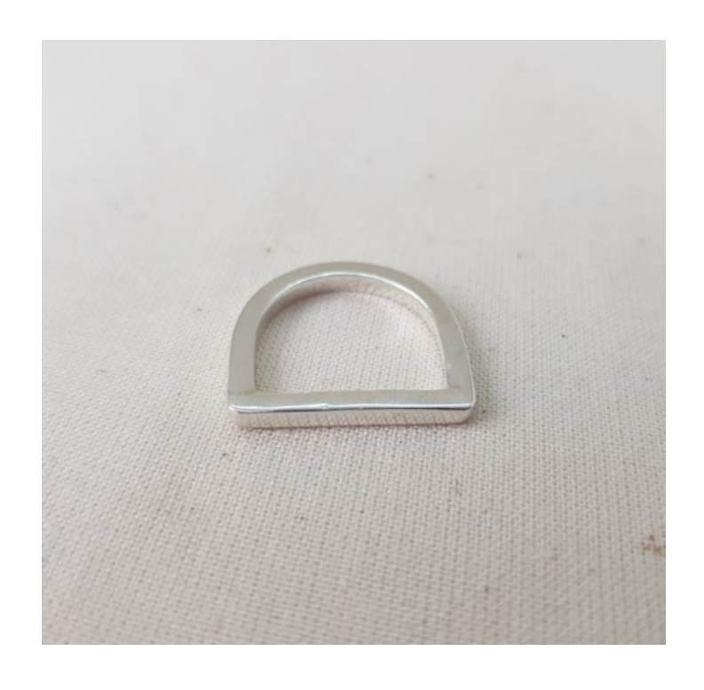
D-Shape Ring EA23 £52