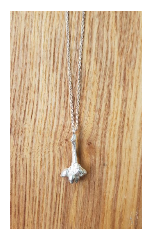
1.4mm Belcher Chain Oak Twig EA55 £143