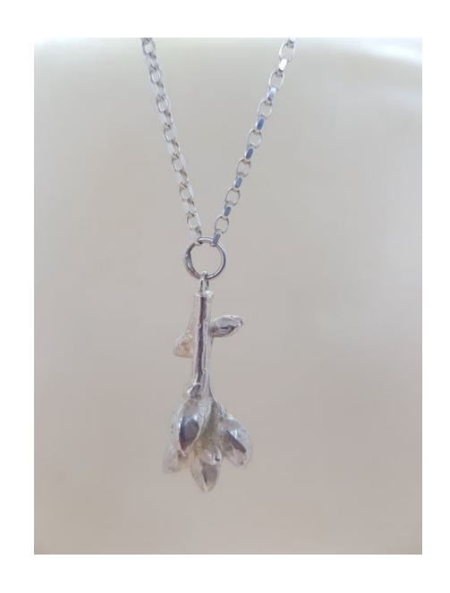
EA65 Oak Twig 2.3mm Chain £169