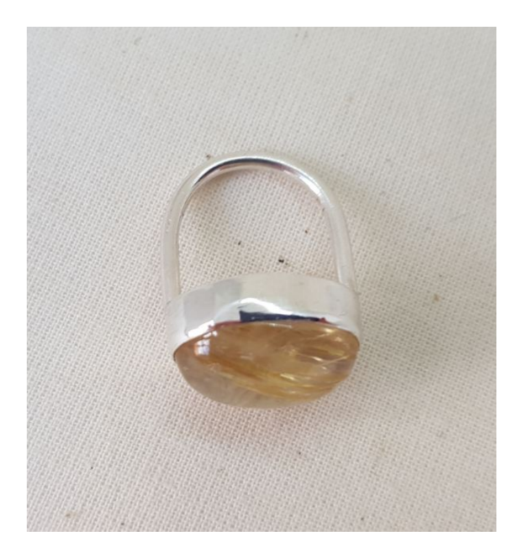
EA41 Side Oval Rutilated Quartz Size N \, \,\pounds 146