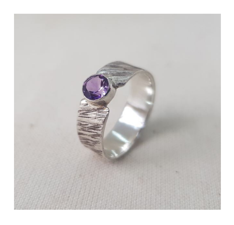
EA48 Amethyst with Lines Wide Band Size M and Half ~\pounds \text{II}5