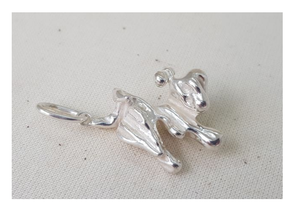
Large Water Cast Birch Twigs Pendant only EA57 £100