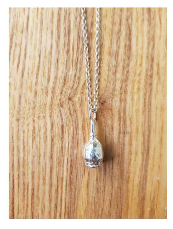
1.4mm Belcher Chain Small Poppy Pod EA53 £123