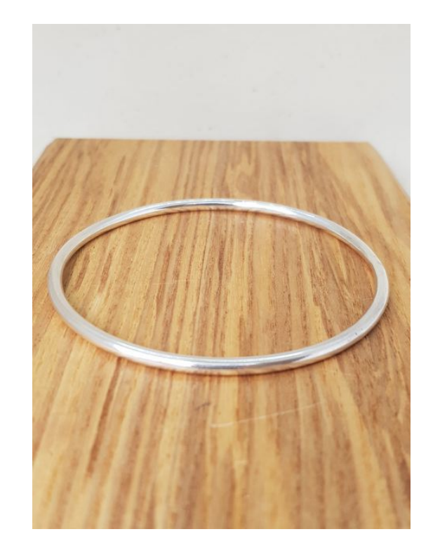
3mm Round Bangle EA75 £88