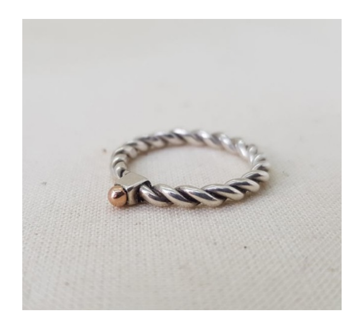
Twisted Ring with 9ct Gold Ball and cube EA18 £106