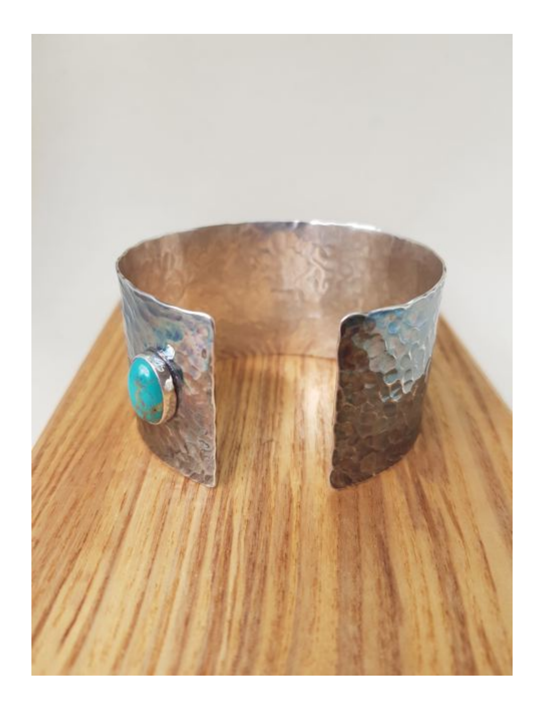
Large\ Oxidised\ Hammered\ 36.5mm\ Wide\ Cuff\ with\ Turquoise\ Stone\ EA81\ \ \pounds277