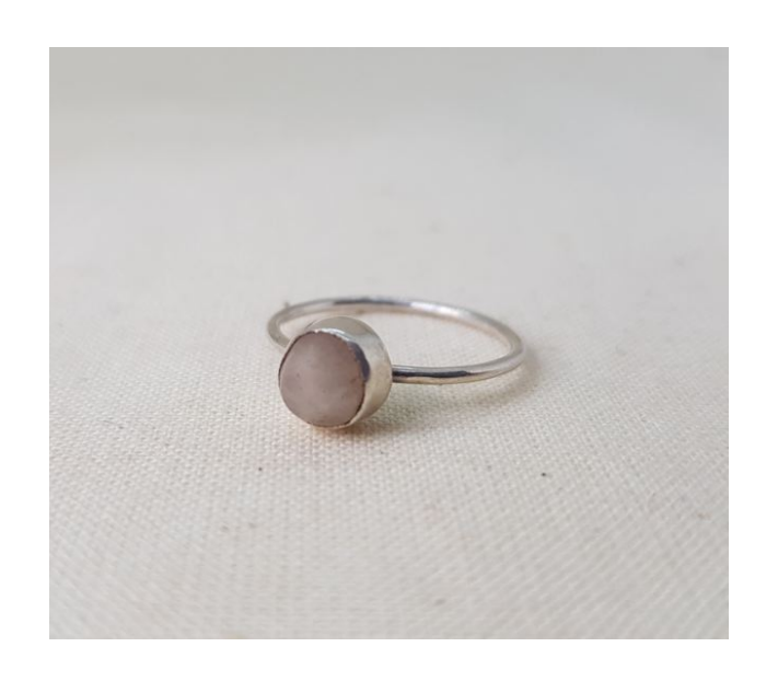
EA32 White Sea Pebble Ring Size M £57