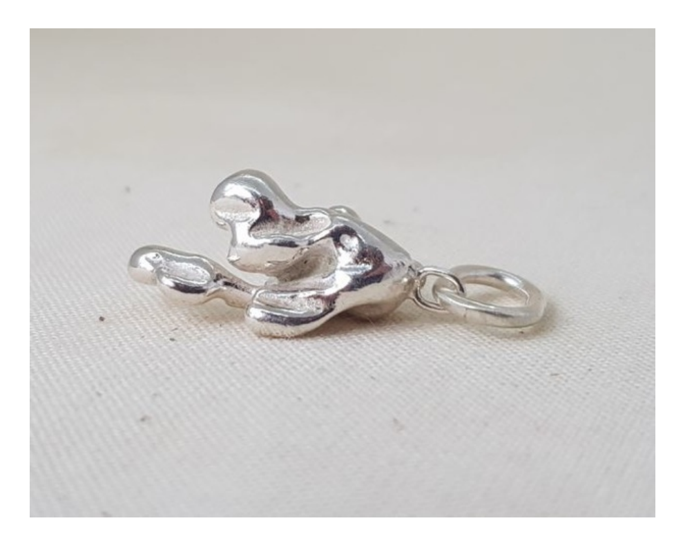
Small Water Cast Birch Twigs Pendant only EA58 £69