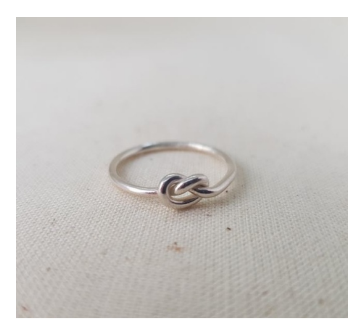
Small Knot Ring EA12 £43