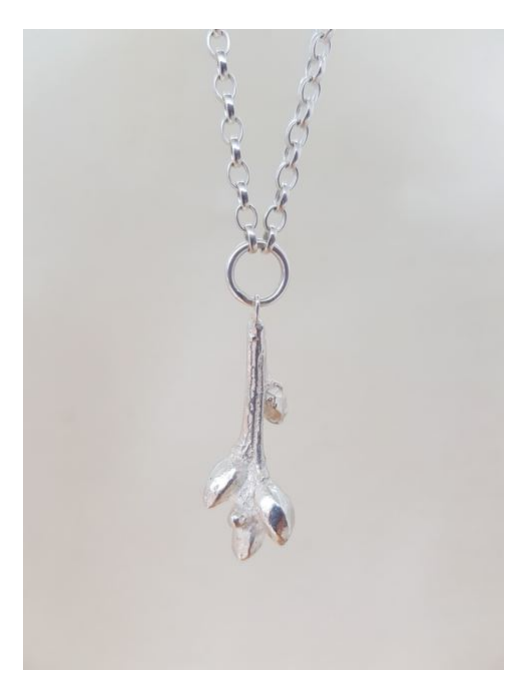
5mm Belcher Chain with Oak Twig EA71 £269