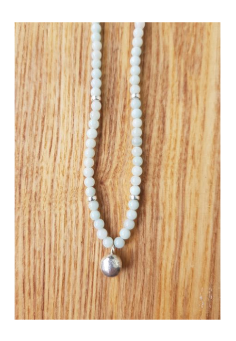
EA62 SOLD Amazonite Beads with Nugget Pendant £140