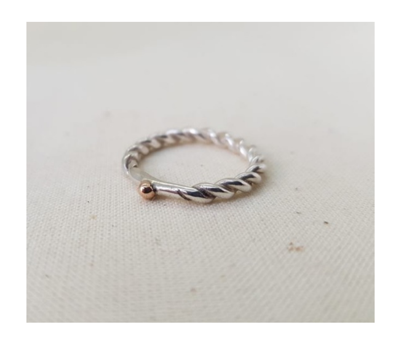
Twisted Ring with 9ct Gold Ball SOLD EA17 £106