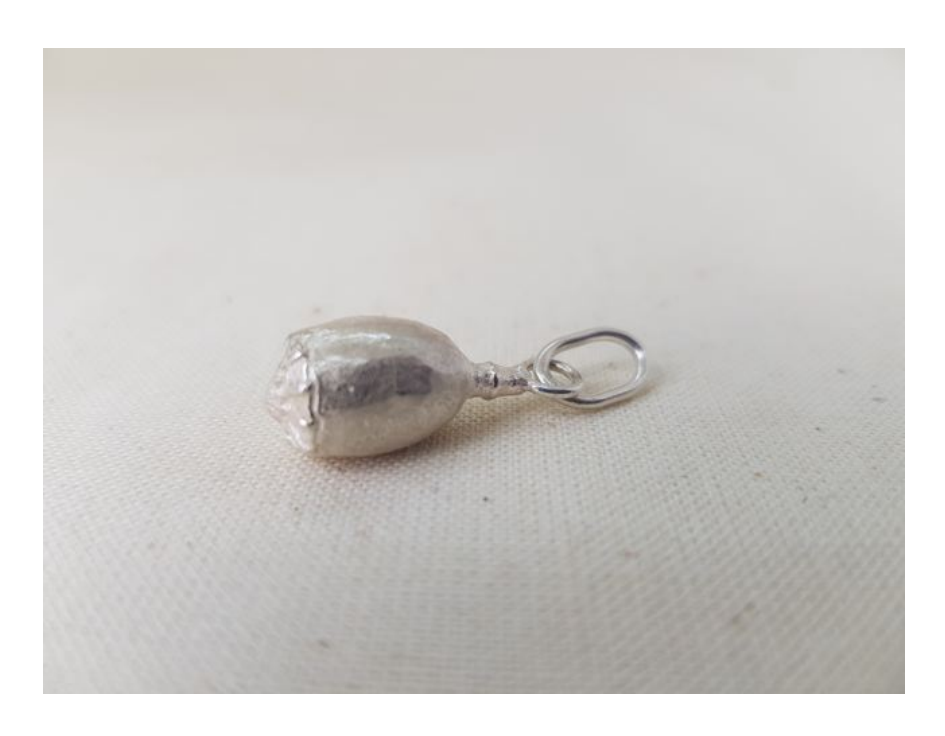
Poppy Pod Pendant only EA61 £88