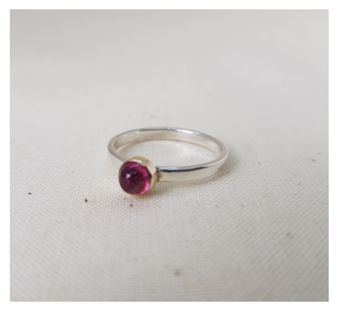
EA35 Pink Garnet Gold Setting Size N \, \,\pounds \text{H}5