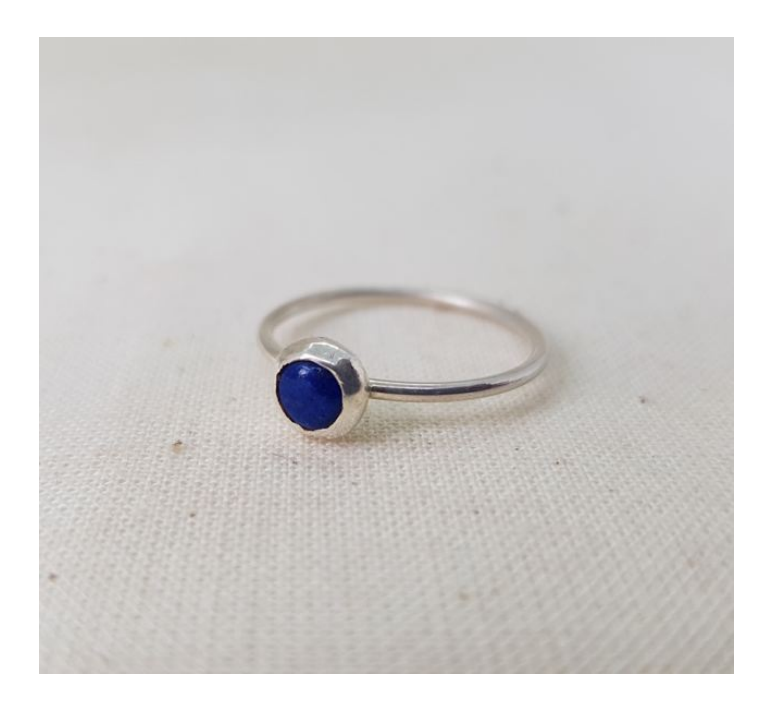
EA29 Lapiz Lazuli Stackable Ring Size N £57