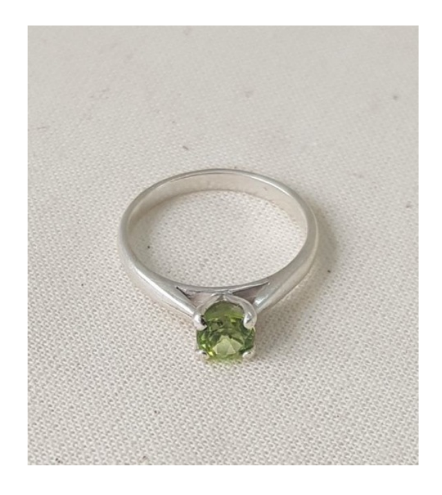
Peridot Claw Setting EA24 £112