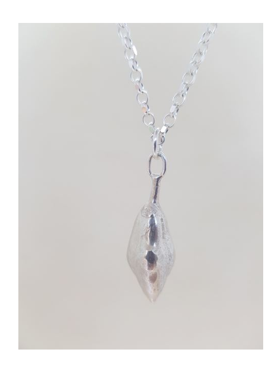
EA68 Alpine Tulip Pod 2.3mm Chain £154