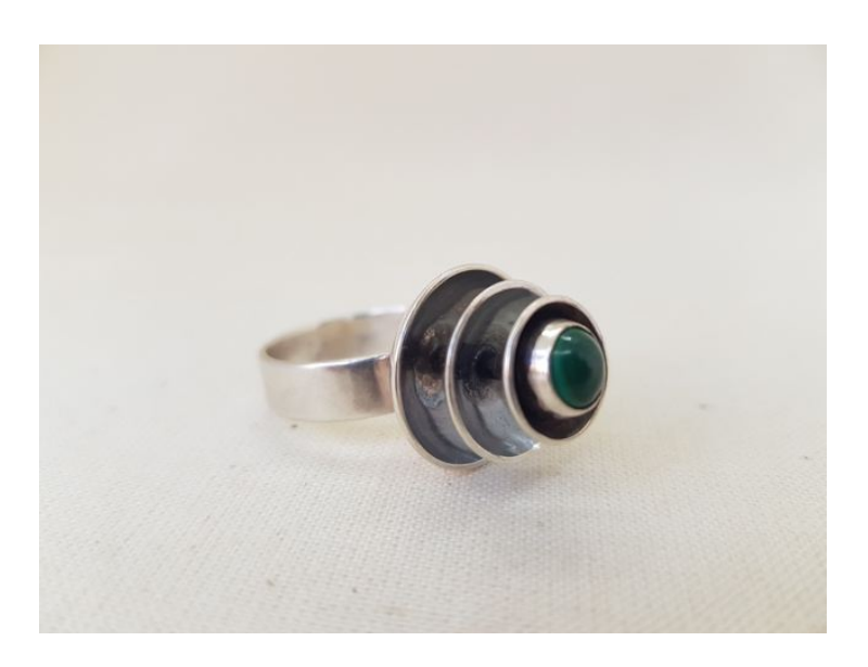
EA47 Multi Disc Ring with Malakite Size M and Half \,\pounds_13_1\,