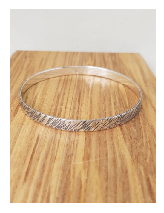
Oxidised Lines Wide Bangle EA77 £103