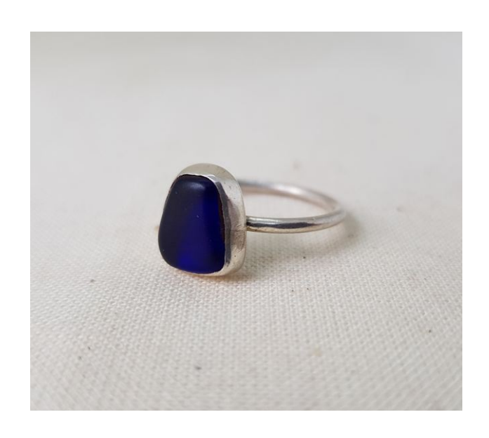
EA33 Dark Blue Sea Glass Ring Size L ~~\pounds_{72}