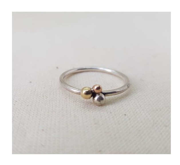
9ct Yellow, 9ct Rose Gold and Silver Cluster Ring EA21 £85