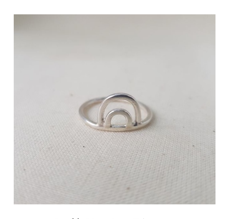
Double Moon Ring EA16 £49