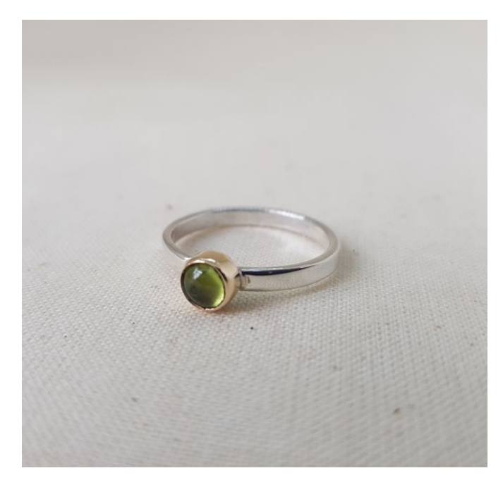
EA36 Peridot 9ct Setting Size N and Half ~\pounds \text{m5}