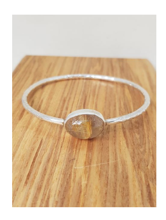
Oval \, Rutilated \, Quartz \, Hammered \, Bangle \, EA80 \quad \pounds 180