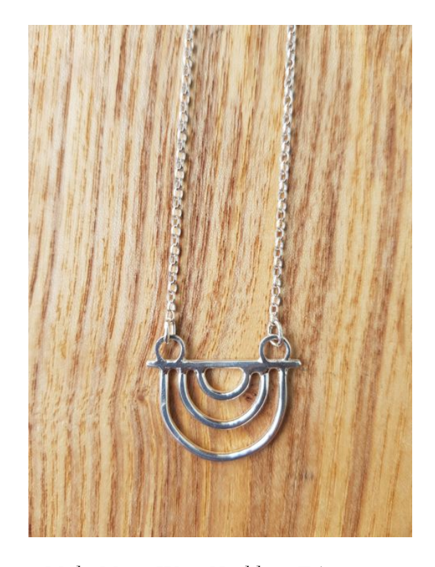
Multi Moon Wire Necklace EA51 £81