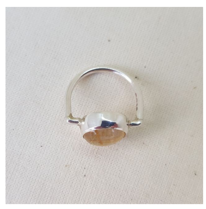
EA42 Rutilated Quartz Ring Size N $£138