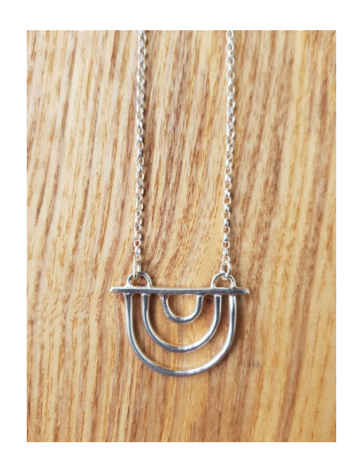
Multi Moon Wire Necklace EA52 £81