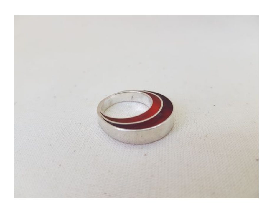
EA45 Red Resin and Silver Ring Size M \,\pounds_{92}