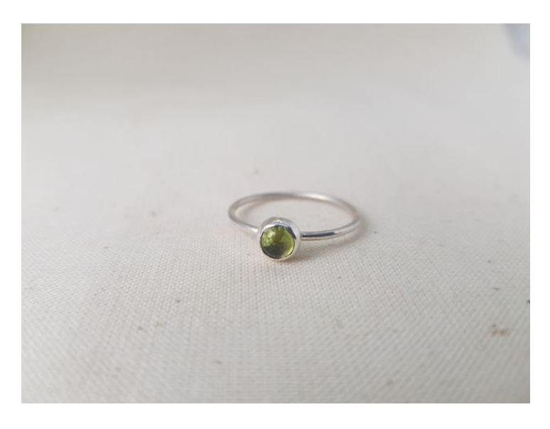
EA28 Peridot Stackable Ring Size N \, £57