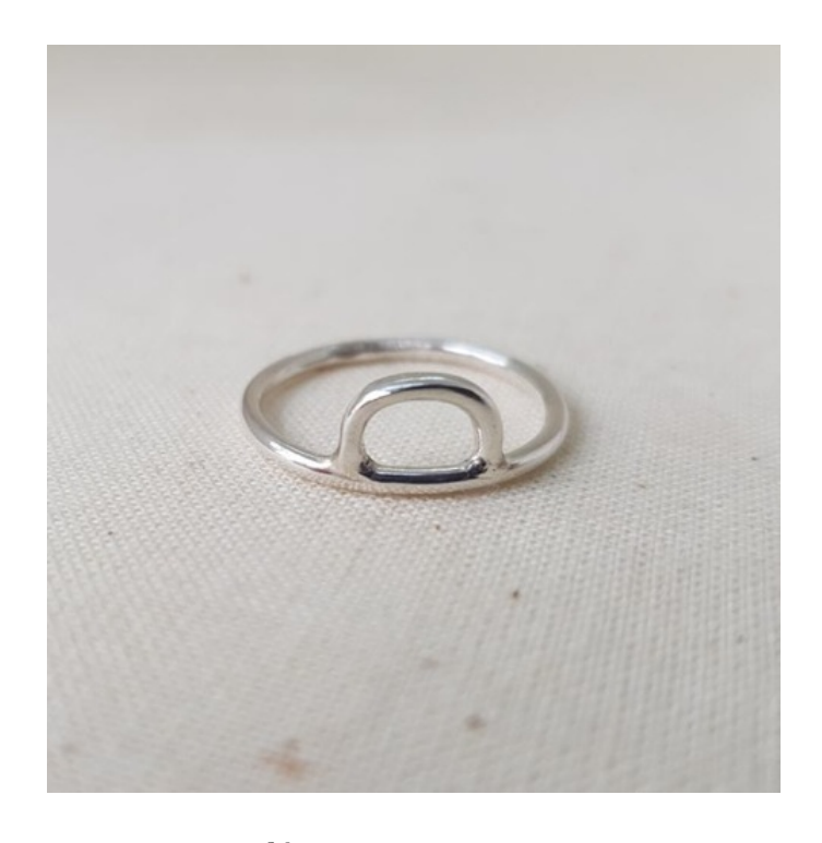
Half Moon Ring EA13 £43