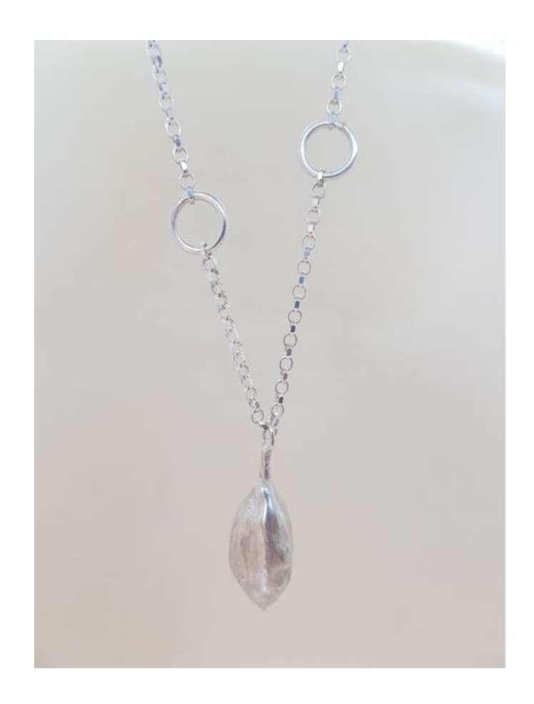
EA70 Alpine Tulip Pod 2.3mm Chain £183