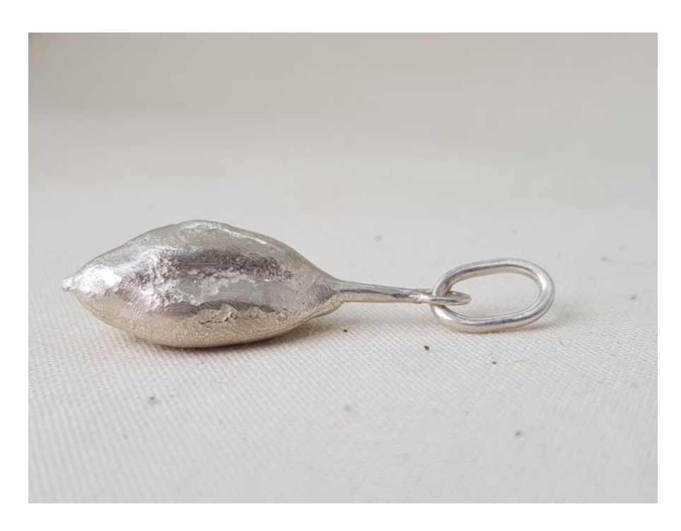
Large\ Alpine\ Tulip\ Pod\ Pendant\ only\ EA59\quad \pounds 103