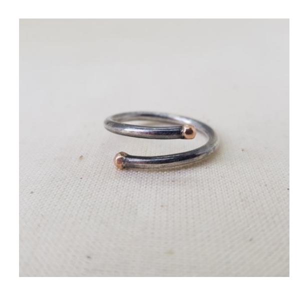
Oxidised\ Wrap\ Ring\ with\ 9ct\ Rose\ Gold\ Ends\ EA22\quad \pounds 97