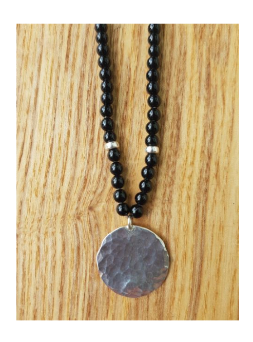
EA63 Onyx Beads with Hammered Pendant £140