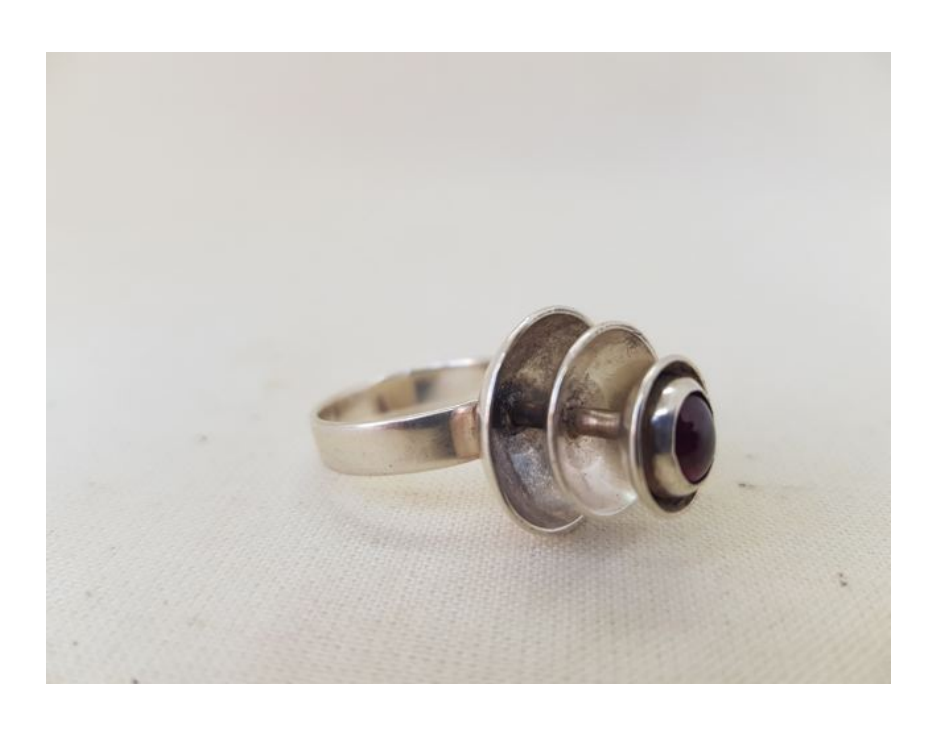
EA46 Multi Disc Ring with Garnet Size M $131