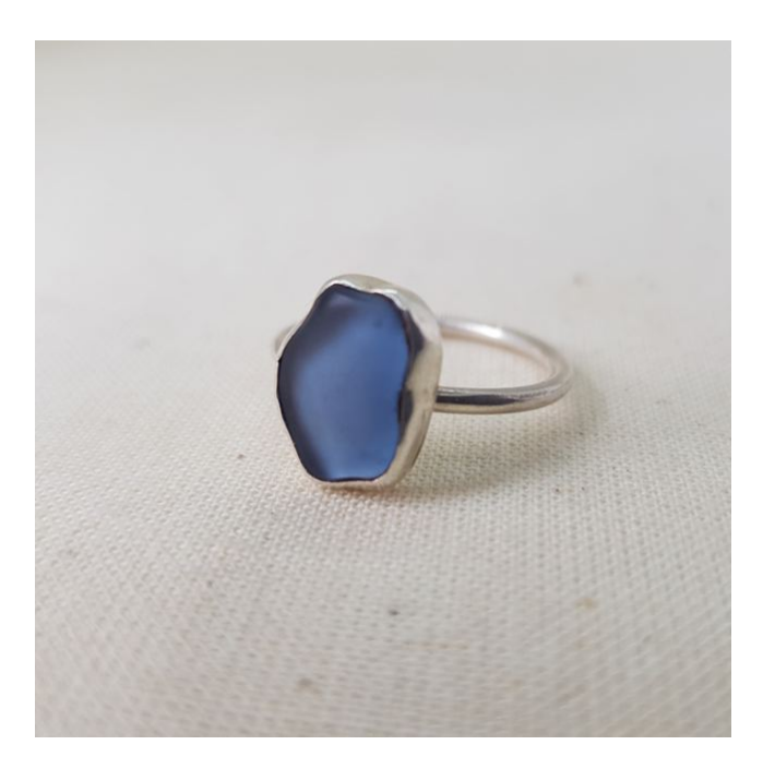
EA34 Light Blue Sea Glass Size M and Half ~~\pounds_{72}