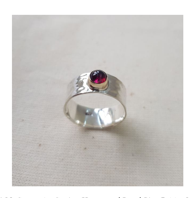
EA38 Garnet 9ct Setting Hammered Band Size P (2) $146