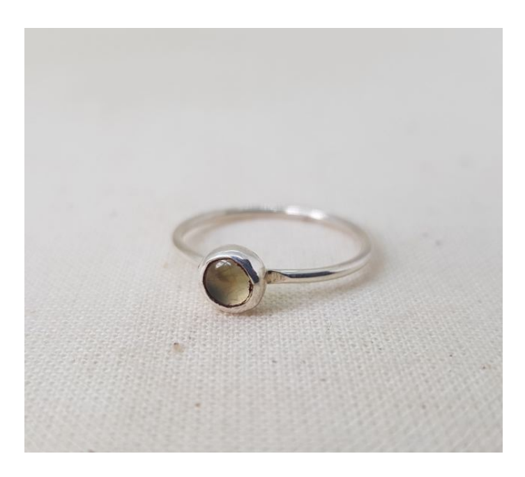
EA3<br/>o Prehnite\,Stackable\,Ring\, Size L ~~\pounds 57