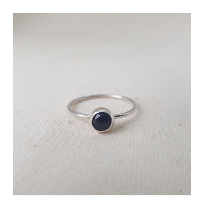
EA31 Hematite Stackable Ring Size P £57