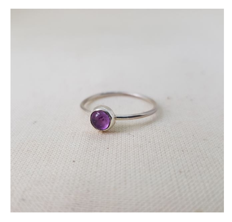
EA27 Amethyst Stackable Ring Size O £57