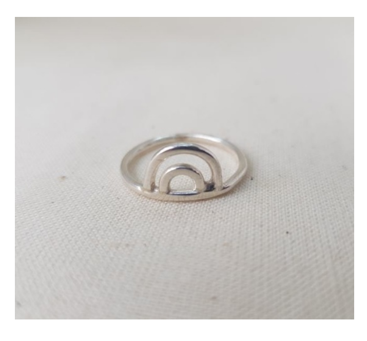
Double Moon Ring EA15 £48