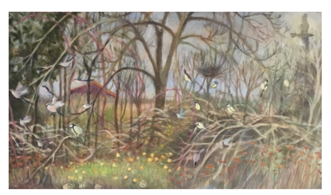
18. A Hedge in Winter, 2020. Oil on board. H710mm W410mm £1,200