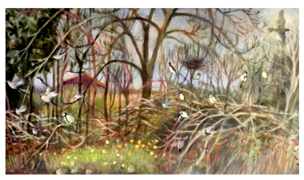
A Hedge in Winter, 2020. Oil on board. H710mm W410mm. (Cat No 18.)

I hung my first bird feeders outside the horsebox one January afternoon.