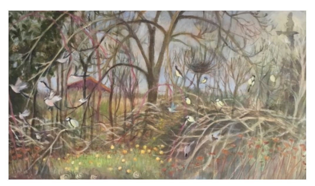
18. A Hedge in Winter, 2020. Oil on board. H710mm W410mm £1,200