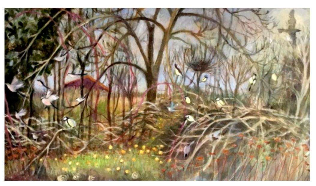
A Hedge in Winter, 2020. Oil on board. H710mm W410mm. (Cat No 18.)

I hung my first bird feeders outside the horsebox one January afternoon.