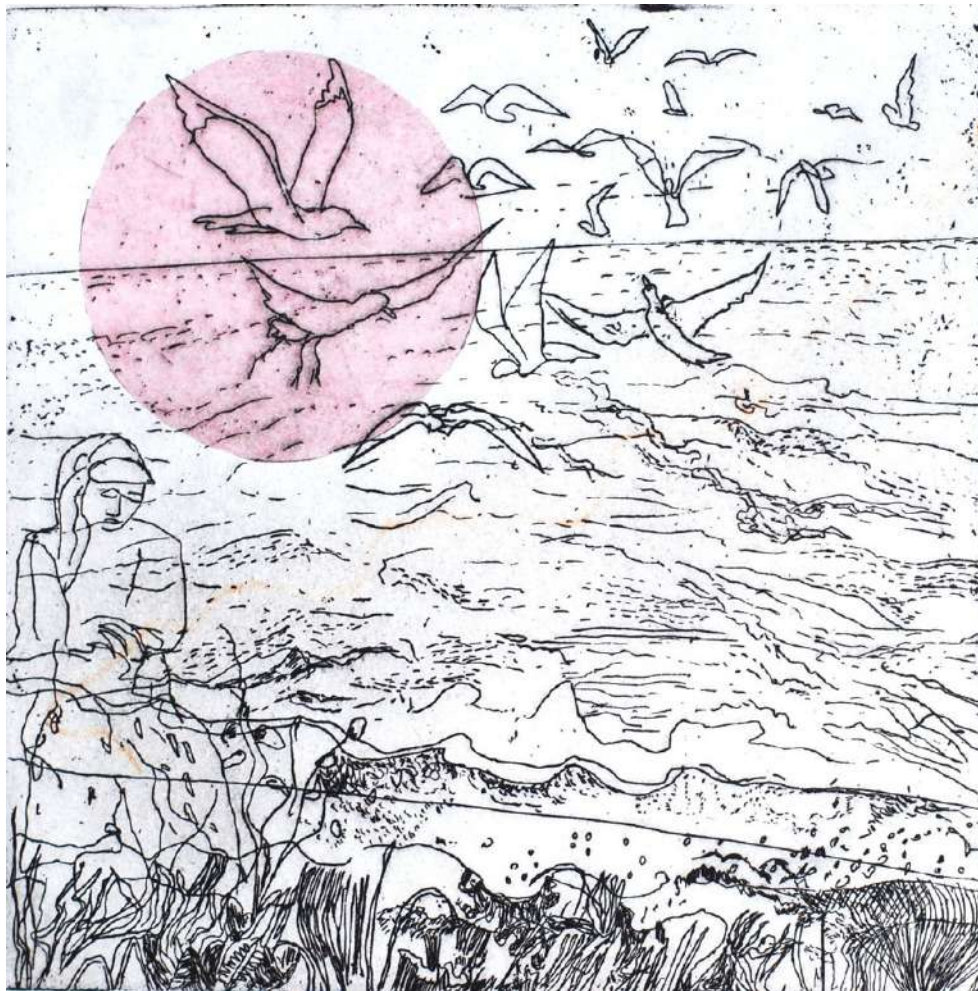
15. Gathering , 2020.